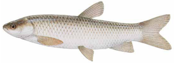
Figure 5. The white amur or grass carp can be stocked (with a permit) to help control aquatic vegetation. Credits: Artwork courtesy Texas Parks and Wildlife Department ©2004

The white amur, commonly called the grass carp (Figure 5), can be stocked into a pond to control aquatic vegetation. A permit must first be obtained from the Florida Fish and Wildlife Conservation Commission before this species can be introduced into a pond in Florida. Only triploid grass carp, which are sterile, are legal for use in Florida ponds.