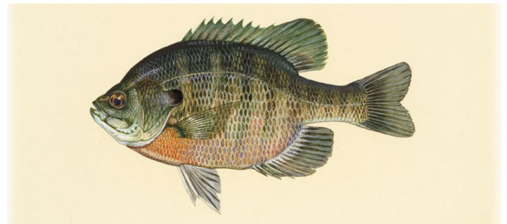
Figure 2. Bluegill provides food for largemouth bass and is a good pan fish.