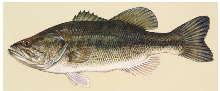
Figure 1. Largemouth bass is one of the most popular gamefish but requires large numbers of prey for good growth.