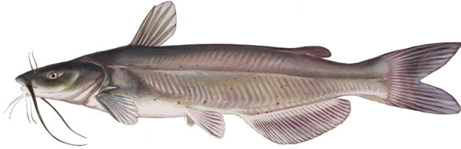
Figure 3. The channel catfish is a popular food and sport fish and can be stocked alone or with other species. Credits: Duane Raver Jr.

The channel catfish (Figure 3) is both a popular food and sport fish in Florida. This species should be stocked alone in ponds smaller than one-half acre or in ponds that are muddy throughout the year. In larger ponds, catfish do well when stocked alone or with bass and bluegill. If stocked alone, catfish may overpopulate if spawning sites are available, so the addition of milk cans and sewer tiles to provide spawning sites is discouraged. In the presence of bass, the survival of small catfish is lowered because of predation. Supplemental stocking with catfish in the 8-to-10 inch size range is required to maintain their population in ponds with bass.