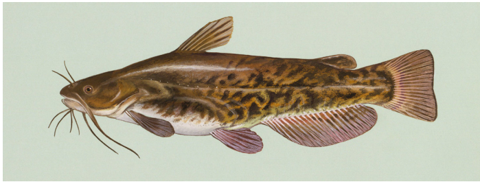
Figure 7. Brown bullheads muddy the water and often become stunted from overpopulation. Credits: Duane Raver Jr.

Common carp and bullheads (Figure 7) should be avoided because they will stir up the pond bottom while feeding, causing muddy water. Bullheads will also often overpopulate in a pond.