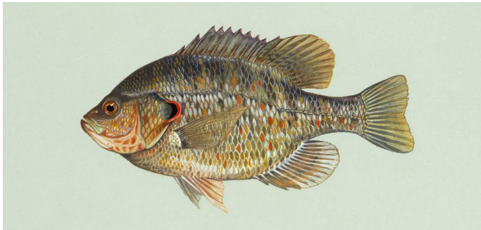
Figure 4. The redear sunfish may be stocked with bluegill as food for bass and as a sport fish for the angler. Credits: Duane Raver Jr.

The redear sunfish (Figure 4), commonly called the shellcracker, can also be stocked as a prey species for bass and as a sport fish for the angler. This species should not be stocked alone or comprise more than 30% of the initial stocking of sunfish (bluegill and redear sunfish) because it will not produce enough offspring to sustain the bass