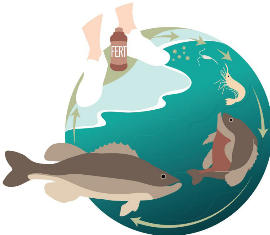
Figure 9. Addition of fertilizer to a pond will increase its productivity.

A fertilization program can also greatly increase the productivity of a pond. Fertilized ponds often maintain two to three times the standing crop (pounds per acre) of fish than unfertilized ponds. Such a program is not warranted unless a pond receives heavy fishing pressure. Contact your County Extension office or your regional Florida Fish and Wildlife Conservation Commission office for further information on pond fertilization specific to your locale (see Florida Cooperative Extension Service FA17, "Fertilization of Fresh Water Fish Ponds").