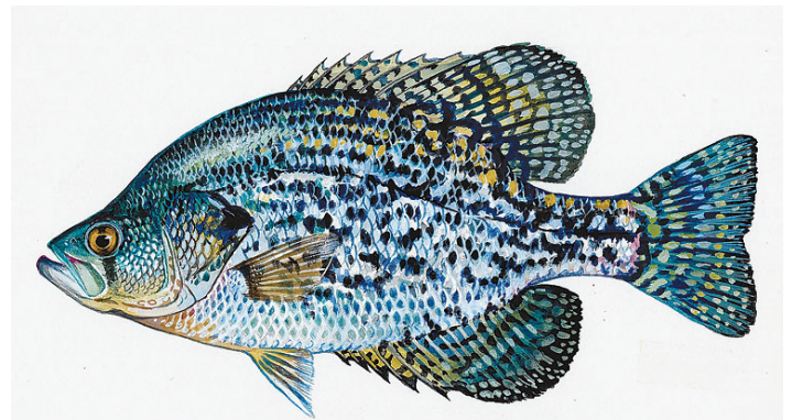
Figure 6. Black crappie, or speckled perch, compete with bass for food, eat small bass, and tend to overpopulate and become stunted in a pond. Credits: Duane Raver Jr.

Black crappie (Figure 6) and white crappie, also known as specks, speckled perch or white perch, are among the worst fish to stock into ponds. They compete with bass for food, eat small bass, and have a tendency to overpopulate and become stunted in a pond. They spawn prior to bass in the