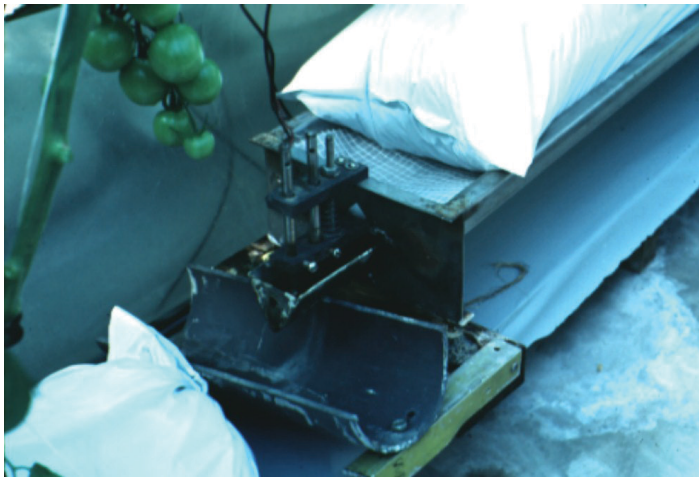
Figure 3. Starter tray for scheduling irrigations for perlite or rockwool systems.

The tray contains one slab that drains into a small trough at the end of the tray. A sensing probe sends a signal to a relay box when the contact between the probe tip and the water in the trough is broken. The relay box signals the irrigation controller (time clock) to open a solenoid and start the irrigation cycle. The length of the irrigation event is preset to deliver the correct amount of water to the slabs. The preset irrigation time interval differs with crop stage and season. Research in Florida shows that this starting tray system can be used for perlite bag culture as well.