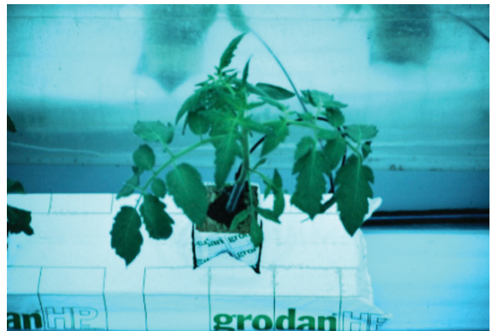
Figure 2. Media for this tomato plant is wrapped in polyethylene to minimize contamination of the root system.

In perlite, peat bag or rockwool culture, the plants are grown in a solid media (perlite-filled bags, compressed rockwool slabs, or loose material made of peat or fiberglass) (Figure 2).