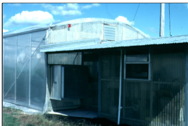
Figure 3. "Airlock" entrance porch to minimize entry of pests into greenhouse.

Greenhouses should be built with an "airlock" entrance design (Fig. 3). This entrance porch prevents direct ingress of wind, insects, soil, and spores into the greenhouse. Such an entrance has the additional advantage of making doors easier to open and close when the fans are operating. The double entrance also prevents short-circuit air flow patterns when ventilation fans are in operation.