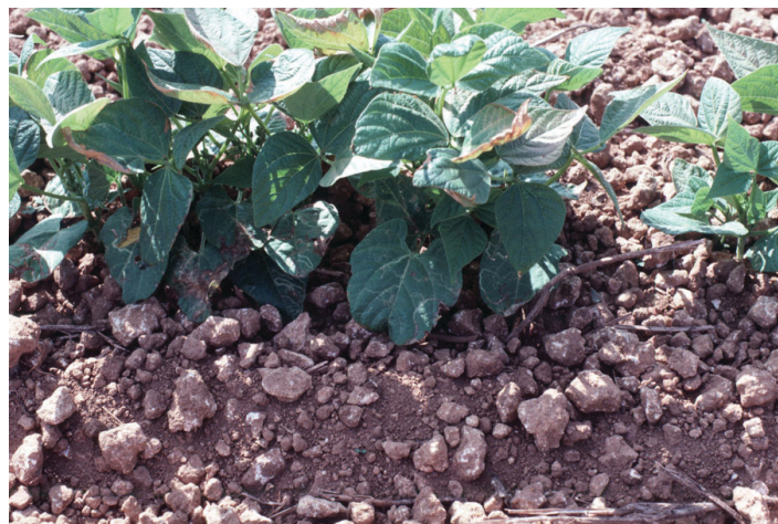
Figure 4. Snapbeans growing in the Rockdale soils of Dade County.

This calcareous soil is composed of a wide range of particle sizes. The soil is very shallow and made of approximately one-fourth calcareous rock (Figure 4).