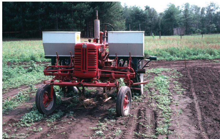
Figure 7. Sidedress fertilizer (dry fertilizer) applicators.

50% of the N and 25% of the K is leached out of the root zone by a 2 to 3-inch rainfall in unmulched culture. The “leaching rain rule” should be used to aid in decisions concerning supplemental fertilizations. If rainfall exceeds 3 inches in 3 days or 4 inches in 7 days, apply 30 lb N/A and 20 lb K 2 O/A. The number of supplemental applications will vary according to the number of leaching rainfalls and the length of the crop growing season.