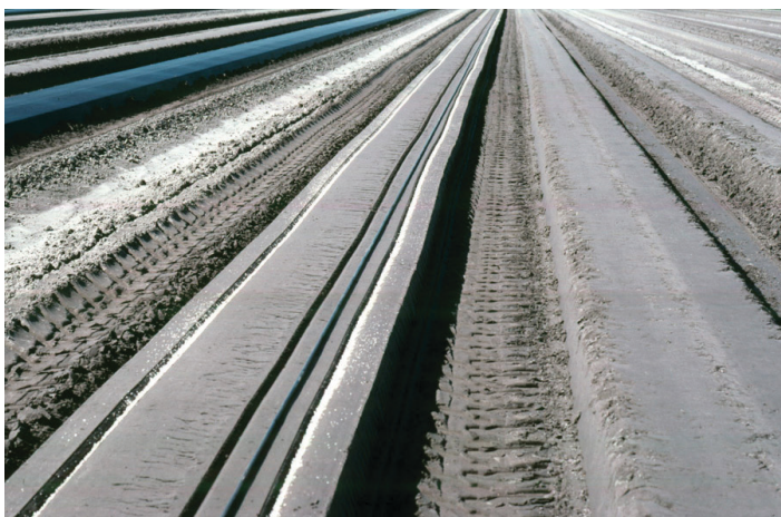
Figure 9. Placement of nitrogen and potassium fertilizer in bands in surface grooves for seep-irrigated, full-bed mulched tomatoes in Hillsborough County.

With subsurface irrigation, all P and micronutrients should be incorporated in the bed. Apply 10 to 20 percent of the N and K with the P. The remaining N and K should be placed in narrow bands on the bed shoulders, the number of which depends on the crop and number of rows per bed (Figure 9). These bands should be placed in shallow (2 to 3 inch deep) grooves. This placement requires that adequate bed moisture be maintained so that capillarity is not broken. Otherwise, fertilizer will not move from the band to the root zone.