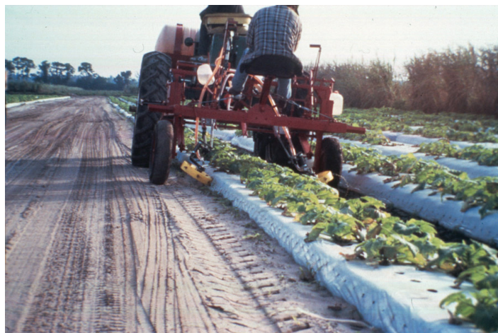
Figure 8. Liquid sidedress fertilizer (injection wheel) applicators.

When using plastic mulch, fertilizer placement depends on the type of irrigation system (subsurface or overhead sprinklers) and on whether drip tubing or the liquid fertilizer injection wheel is to be used (Figure 8).