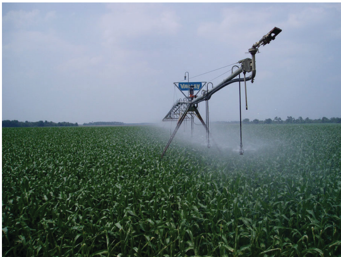
Figure 2. Center-pivot irrigation of sweet corn on sandy soils in northern Florida.

recommendations are the mucky sand soils. Because of their sandy nature, the above soil types require careful management of irrigation and fertilizer programs to ensure maximum yields (Figures 2 and 3). The sandy mucks, because of their higher organic matter content, require less N than other mineral soils. Nitrogen is highly mobile in sandy soils and moves with the water in the soil. Therefore N and irrigation should be managed together to keep N in the root zone and minimize the chances for N leaching to the ground water. Potassium can be mobile in sandy soils, especially coarse sandy soils with low cation exchange capacity.