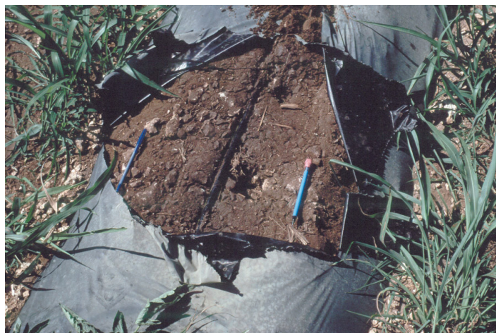
Figure 10. Drip irrigation on tomatoes in Miami-Dade County.

The combination of mulch and drip irrigation often provides an excellent yield-boosting system. The drip irrigation method results in substantial water savings and can be used to supply fertilizer (Figures 10 and 11). When fertilizing through the drip, all P and micronutrients and 20 to 40 percent of N and K should be applied preplant. Use the lower rate where sub-irrigation will be used to provide a portion of the irrigation water at the beginning of the season. Apply the remaining N and K through the drip system in increments corresponding to the growth of the crop.