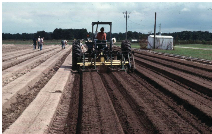
Figure 1. The modified broadcast method of incorporating fertilizer in the bed area with a rototilling machine.

Broadcast —Spreading fertilizer evenly over the entire soil surface and, usually, thoroughly incorporating it. The modified broadcast method involves broadcasting the fertilizer in a 3- to 4-foot swath in the bed area only (Figure 1).