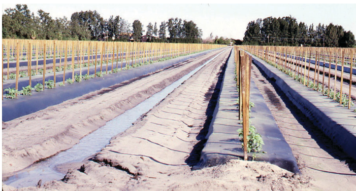
Figure 3. Tomatoes growing on subsurface (seepage)-irrigated soil in Collier County.