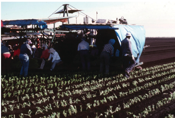
Figure 5. Celery production on muck soil in the Belle Glade area of Palm Beach County.