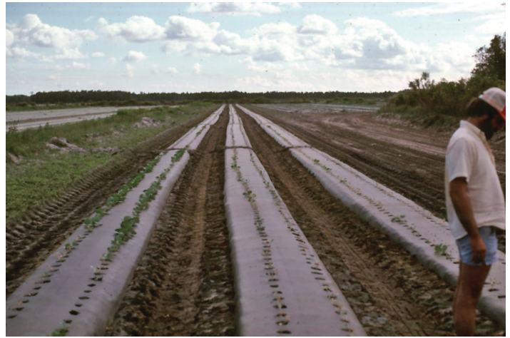
Figure 6. Soluble salt injury from improper fertilizer placement for cabbage near Immokalee in Collier County.

Over-fertilization or placement of fertilizer too close to the seed or root leads to soluble salt injury or burn (Figure 6). Injury occurs because the increased salt level in the soil causes less water to move to the root, (the salts attract the water), leading to water stress and desiccation of the roots. Fertilizer sources differ in their capacity to cause soluble salt injury. However, it is usually the excessive rate of fertilizer or the close placement and not the specific fertilizer source that is most often associated with fertilizer burn.