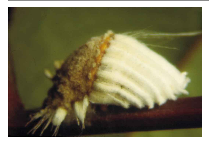
Figure 10. Cottonycushion scale.

mold. On occasions young citrus trees can be killed by high populations of soft brown scale from feeding and honeydew production. Scale feeding on older trees results in reduced tree vigor, twig dieback, reduced yields, and lower fruit grades due to heavy sooty mold. Soft brown scale can be found infesting a wide range of ornamental plants.