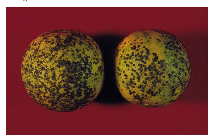
Figure 7. Florida red scale on fruit.