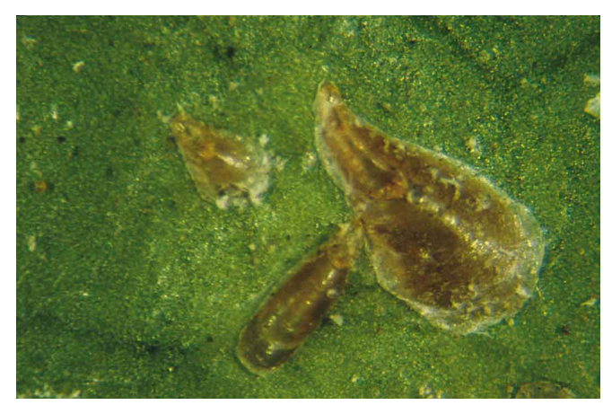
Figure 1. Purple scale.

required as biological control by a parasitic wasp, Aphytis lepidosaphes Compere and the ladybeetle, Chilocorus stigma Say, provide adequate control. Other predators and parasitic fungi have also been found attacking the purple scales in Florida.