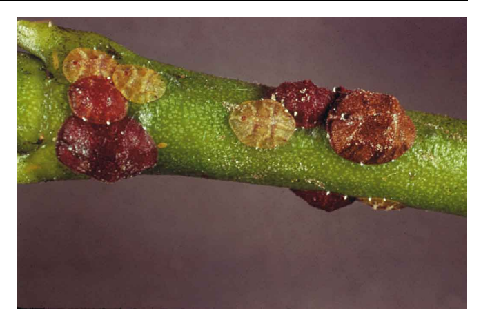
Figure 9. Caribbean black scale (various stages).

The female is 3 to 5 mm long and brown to black in color. When mature it has a very tough shell which is nearly circular or hemispherical in shape (Fig. 9). Ridges along the outer scale body form an "H" pattern. Immature scales have a lighter scale covering and lack the "H" in the early instars. Adult males are free flying. Crawlers are about 0.34 mm long and are light brown. Scales are found on young fruit stems and twigs. Caribbean black scales secrete prolific amounts of honeydew onto the stems and fruit, which later develops sooty mold that will lower fruit grade, if not washed off. A wasp, Scutellista cyanea (Motscholsky), is an egg predator that provides acceptable biological control. When inspecting mature scale for parasitism, one will frequently notice a circular emergence hole in the scale covering caused by the wasp.