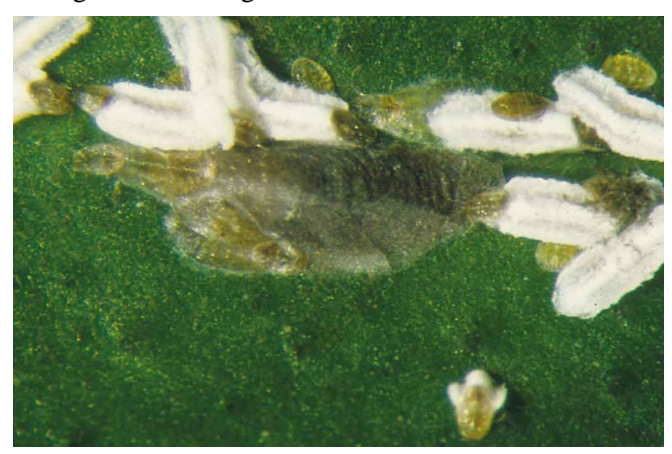
Figure 5. Snow scale, male and females.

Predators commonly found attacking other armored scales have also been found feeding on citrus snow scale. Native and introduced strains of Aphytis lingnanensis Compere and Encarsia spp. are common biological control agents.