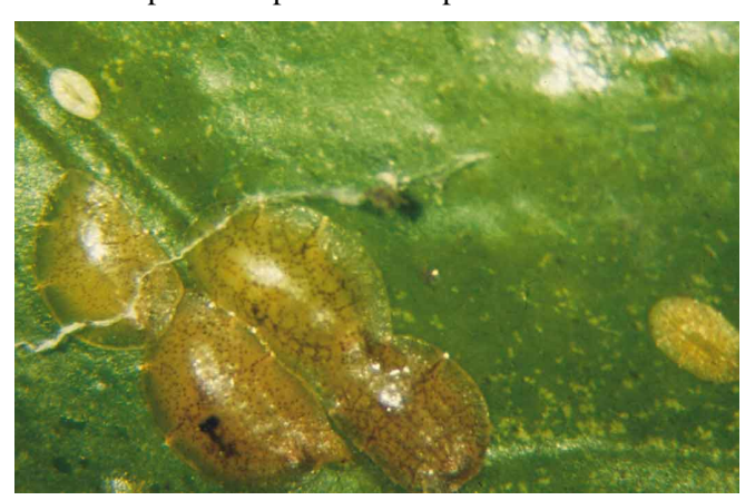
Figure 11. Soft brown scale.

The scale is heavily parasitized by several different species of parasitic wasps.