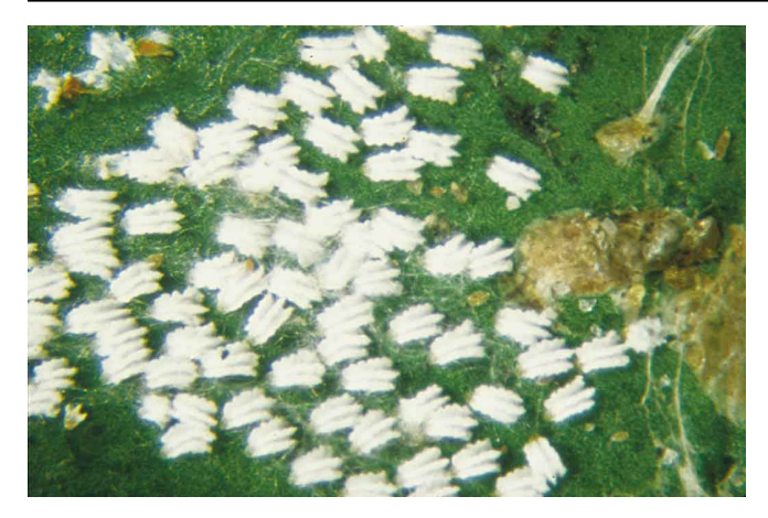
Figure 4. Fern scale.

Citrus snow scales primarily attack the trunk and large limbs of the tree, but can be found on leaves, twigs and fruit at high population levels. All scale insect stages are present throughout the year. Prolonged feeding on the tree trunk appears to be associated with splitting of trunk bark. This symptom is more prevalent on young trees compared to mature trees.