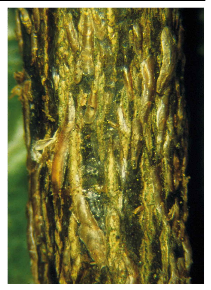
Figure 3. Glover scales on bark.