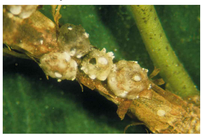
Figure 12. Florida wax scale.

extract sap from leaves or twigs. Young scales have a similar wax covering. Large amounts of honeydew are secreted by this species. Immature stages of Florida wax scales are found on the leaves and twigs with older stages frequently found on twigs and branches. Leaf populations are aligned with the leaf midrib. Florida wax scales are seldom found in large numbers due to presence of effective natural enemies.