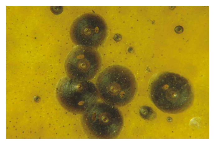
Figure 6. Florida red scale, larger scales contain parasite emergence holes.

Florida red scale is under biological control by the introduced parasite, Aphytis holoxanthus (DeBach). Some additional insect predators feed on Florida red scale.