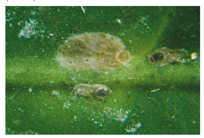
Figure 8. Chaff scale.

infested, the areas around the scale remains green at maturity. Chaff scale can also be found under the calyx of the fruit. When found on the leaves, the midrib is a favored site for settling. Chaff scales are difficult to remove from the fruit surface in normal packinghouse operations. Effective biological control is provided by the parasitic wasp, Aphytis hispanicus (Mercet).