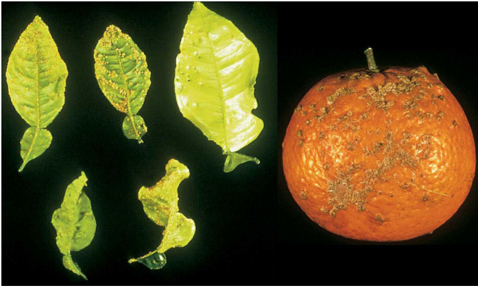
Figure 2. Scab on foliage and fruit. Credits: UF/IFAS CREC