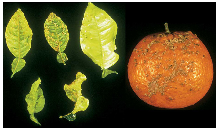
Figure 2. Scab fungus.

Osceola produces a medium-small (2¼” - 2¾”) highly colored fruit. The rind is thin and leathery and peels rather easily. The peel surface is smooth and glossy. The flesh and juice is well colored with high sugar and high acid which is not the best combination for some palates. Seed numbers vary with cross-pollination with 15-25 seeds per fruit when pollinizer varieties are nearby. Cross-pollination is essential to insure good productivity and to enhance fruit size. Orlando tangelo and Temple appear to be good pollinizers for Osceola. The fruit (and leaves) is susceptible to scab fungus (Figure 2). Harvesting Osceola should be done with clippers to avoid tearing of the peel (plugging).