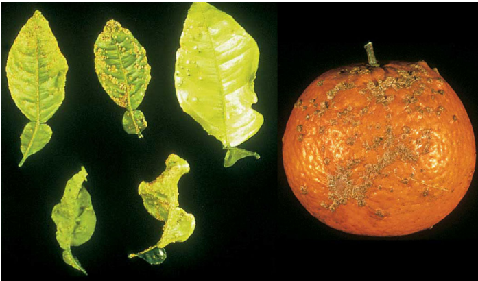
Figure 2. Scab fungus

tangerine-type tree grown in Florida. The tree's cold susceptibility and the later maturity of fruit make Temple a poor choice for colder locations of the state.