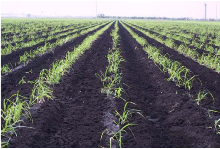
Figure 2. Sugarcane/energy cane seedlings