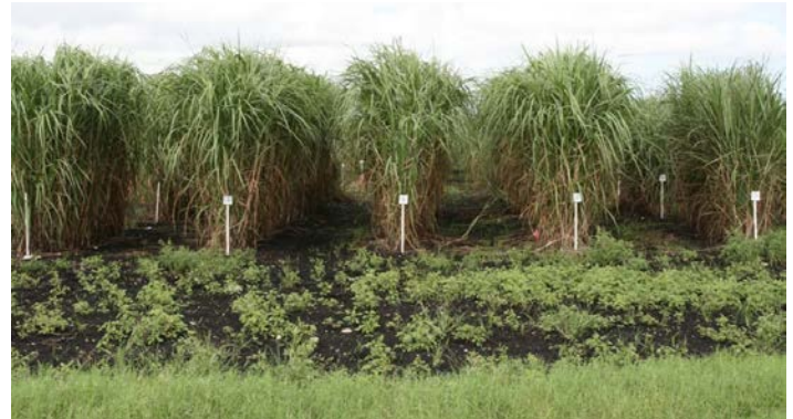
Figure 3. Sugarcane/energy cane field

planting varies widely depending on harvest methods, growing conditions, and the particular variety being harvested. For more detailed information on sugarcane biology, please refer to EDIS publication SC034, Sugarcane Botany: A Brief Review ( http://edis.ifas.ufl.edu/sc034 ).