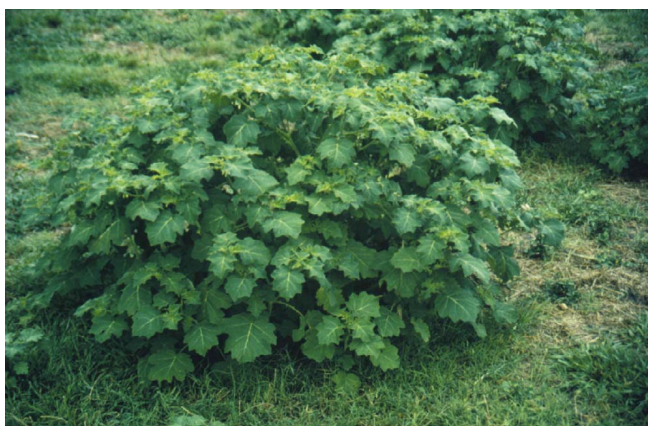
Figure 5. Tropical soda apple ( Solanum viarum ), first collected from Florida in 1988, is now a common weed on 500,000 acres of pastures, roadsides, ditchbanks, cultivated land and natural areas. It is prohibited by DEP and listed as a noxious weed by FDACS and USDA.