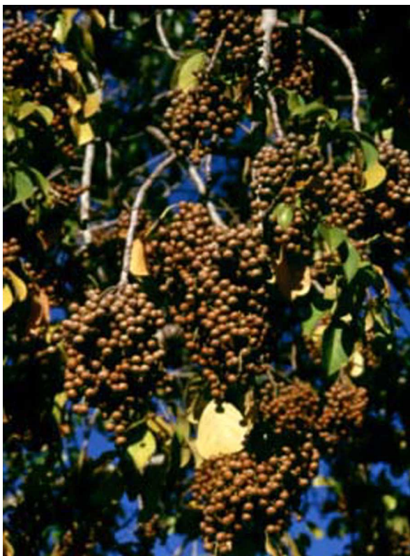
Figure 14. Bischofia ( Bischofia javanica ) is a weedy tree in landscapes. It is common in old fields and disturbed wetland sites and also invades intact cypress domes and tropical hardwood hammocks of south Florida. It is not statutorily prohibited, but it is listed as invasive by the Florida EPPC, and its use has been discouraged by the FNGA.

available for sale from the IFAS Extension Bookstore at http://ifasbooks.ufl.edu (Ph: (352) 392-1764).