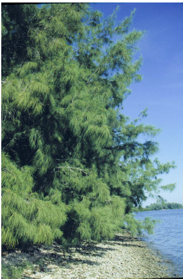
Figure 4. Australian pine ( Casuarina equisetifolia ) was introduced to Florida in the late 1800s and planted extensively in the southern half of the state. It is salt-tolerant and invades pinelands, sandy shores, and front-line dunes where it produces dense shade, litter accumulation and displaces native vegetation. It is prohibited by DEP. Credits: