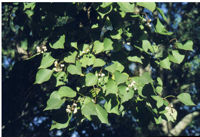
Figure 8. Chinese tallow ( Sapium sebiferum ), sometimes called popcorn tree, has been considered an invasive pest plant in the Carolinas since the 1970s and is expanding its range on the US Gulf Coast through Florida. It is widely dispersed by birds and thrives in undisturbed areas such as closed canopy forests, bottomland hardwood forests, shores of water bodies, and sometimes on floating islands. It is listed as a noxious weed by FDACS.