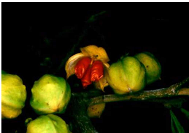
Figure 10. Carrotwood ( Cupaniopsis anacardioides ) is a popular landscape tree throughout southern Florida. It produces large crops of seed, which are eaten and transported by birds. It is now naturalized on spoil islands and in tropical hammocks, pinelands, mangrove swamps, cypress domes, scrub, and coastal strand communities. It is listed as a noxious weed by FDACS.

publications can conform in their description and categorization of non-native plants that are invading natural areas in Florida. None of the plant species in this publication has been assessed by this method to date. More information is available in EDIS publication SS-AGR-86 The Story Behind the IFAS Assessment of Non-Native Plants in Florida's Natural Areas .