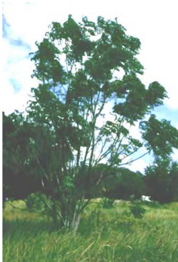
Figure 15. Chinaberry ( Melia azedarach ) occurs primarily in disturbed areas such as rights-of-way and fencerows and has begun invading floodplain hammocks, marshes, and upland woods, particularly in north Florida. It is not statutorily prohibited, but it is listed as invasive by the Florida EPPC, and its use has been discouraged by the FNGA.

Removing non-native invasive plants from private property can eliminate a major source of