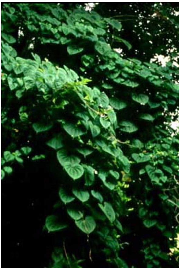
Figure 11. Air potato ( Dioscorea bulbifera ) can climb high into tree canopies and engulf surrounding vegetation. It is listed as a noxious weed by FDACS.