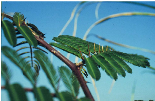
Figure 6. Catclaw mimosa ( Mimosa pigra ) is a sprawling, prickly shrub that was first identified in Florida in 1953 and now occurs on 1,000 acres of river floodplain, swamp forest, and lake margins in Broward, Palm Beach, Marin, St. Lucie, and Highlands counties. It is prohibited by DEP and listed as a noxious weed by FDACS and USDA.

EPPC list itself does not carry statutory authority. Examples of EPPC "Category I" plants (in addition to the ones already listed as prohibited) include earleaf acacia ( Acacia auriculiformis , Figure 13 ), bischofia ( Bischofia javanica , Figure 14 ), and Chinaberry ( Melia azedarach , Figure 15 ). The EPPC list is modified as merited by new observations. A copy of the EPPC's list of Florida's invasive plants can be obtained by contacting your County Cooperative Extension Service office, the UF/IFAS Center for Aquatic and Invasive Plants (352-392-9614) or on the EPPC Web site ( http://www.fleppc.org ).