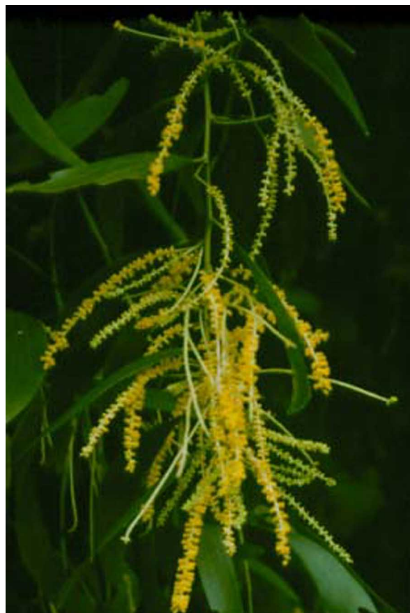
Figure 13. Earleaf acacia ( Acacia auriculiformis ), a messy tree in landscapes, invades disturbed areas as well as pinelands, scrub, hammocks, and pine rocklands in south Florida. It is not statutorily prohibited but is listed as invasive by the Florida EPPC.