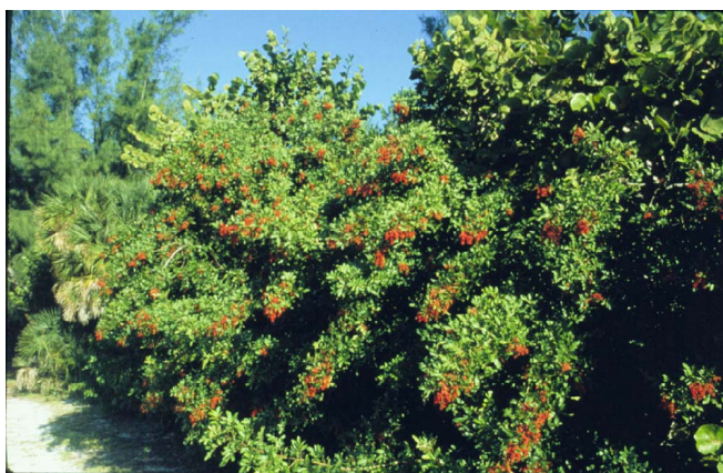
Figure 3. Brazilian pepper tree ( Schinus terebinthifolius ) was introduced to Florida in the 1840s as a cultivated ornamental. It is an extremely invasive plant that invades fallow farmland, pinelands, and hardwood hammocks of south and central Florida, and mangrove forests as far north as Levy and St. Johns counties. It is prohibited by DEP and listed as a noxious weed by FDACS.