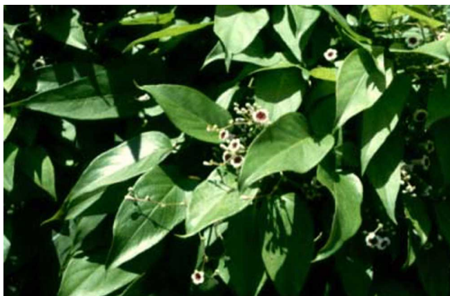
Figure 12. Skunk vine ( Paederia foetida ) invades native plant communities in Florida and can create dense canopies leading to the death of native vegetation. The plant emits a foul odor, especially when the leaves are crushed. It is listed as a noxious weed by FDACS.

agricultural crops, and by accident. They now exist in our landscapes, and some are still sold commercially. Invasive non-native plants growing in proximity to natural areas are a source of invasion. Seeds and