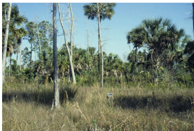
Figure 1. Designating certain lands to be managed (or restored) as natural areas is one method of protection for native plant and animal communities.

Weeds are undesirable plants. Homeowners battle weeds in their lawns, gardens, and ponds. Weeds are considered unsightly in parks and playgrounds. Weeds interfere with transportation and can cause hazardous conditions along highways, railroads, and waterways. Foresters control weeds to enhance the growth of commercial forests. In the United States alone, farmers spend $8 billion annually to manage weeds; nevertheless, crop losses caused by weeds amount to $10 billion annually.