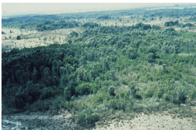
Figure 7. Melaleuca, or Australian paperbark ( Melaleuca quinquenervia ), once widely planted in Florida, now forms dense thickets and displaces native vegetation on 391,000 acres of wet pine flatwoods, sawgrass marshes, and cypress swamps in the southern part of the state. It is prohibited by DEP and listed as a noxious weed by FDACS.