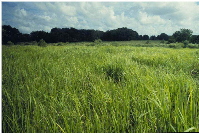
Figure 2. Cogongrass ( Imperata cylindrica ) has invaded many habitats such as sandhills, flatwoods, grasslands, swamps, river margins, and dry sand dunes throughout Florida and other southeastern states. It is listed as a noxious weed by FDACS and USDA.

Florida Department of Environmental Protection's (DEP) Prohibited Aquatic Plant List ( http://www.dep.state.fl.us ) Plants that occur on at least one of these lists and may occur on private property in Florida include cogongrass ( Imperata cylindrica , Figure 2), Brazilian pepper tree ( Schinus terebinthifolius , Figure 3), Australian pine ( Casuarina spp., Figure 4), tropical soda apple ( Solanum viarum , Figure 5), catclaw mimosa ( Mimosa pigra , Figure 6), Australian paperbark ( Melaleuca quinquinervia , Figure 7), and Chinese tallow ( Sapium sebiferum , Figure 8), Old World climbing fern ( Lygodium microphyllum , Figure 9), carrotwood ( Cupaniopsis anacardioides , Figure 10), air potato ( Dioscorea bulbifera , Figure 11) and skunk vine ( Paederia foetida , Figure 12). In addition to plants that are regulated at the federal and state levels, 21 Florida counties and cities have ordinances that prohibit planting or require removal of 45 non-native plant species.