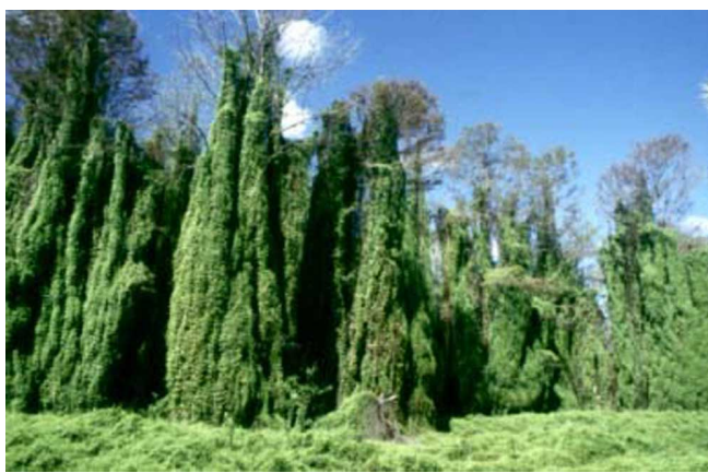
Figure 9. Old World climbing fern ( Lygodium microphyllum ) aggressively invades cypress swamps and tree islands in south Florida and carries both wildfires and prescribed burns through natural barriers. It is listed as a noxious weed by FDACS.

UF/IFAS is assessing the characteristics of non-native plant species (those not prohibited by statute) in Extension Publications using the IFAS Assessment of Non-Native Plants in Florida's Natural Areas ( http://agronomy.ifas.ufl.edu/IFASassessmt.html ). The purpose of the assessment is to provide a well-defined mechanism by which all IFAS Extension