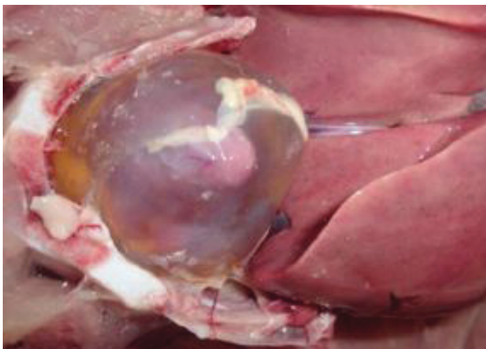
Figure 3. Hydropericardium. Credits: Mohamed Hossiny