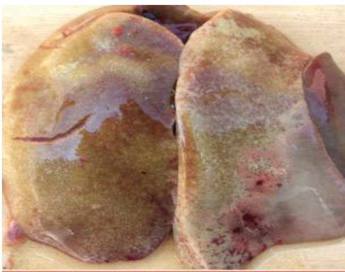
Figure 4. Enlarged liver with extensive necrosis.