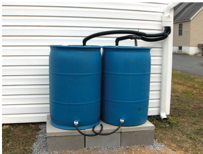
Figure 1. Rain barrel installation collecting from gutters.

Rain barrels are a great way to conserve water, save money, and contribute to a sustainable landscape. By collecting rainwater, we also reduce the amount of water flowing off our properties into the surrounding environment. Because the average rainfall in Florida, based on weather data collected from 1991 to 2020 from the US National Centers for Environmental Information, ranges from 48 to 73 inches in a year, rain barrels are an excellent resource of water to use in our gardens and landscape.