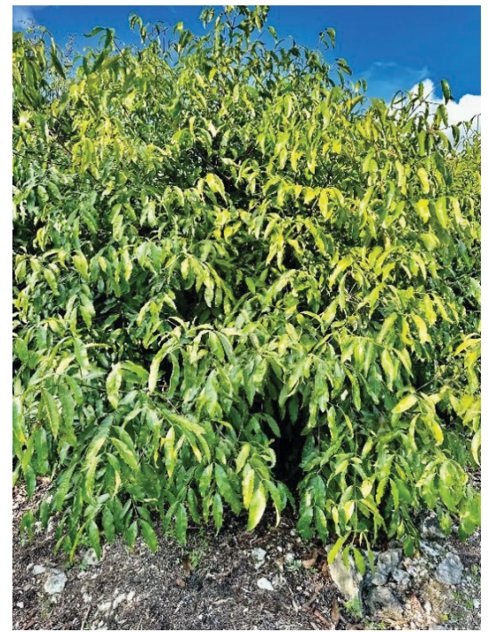
Figure 1. Eight-year-old achachairú tree.

The achachairú is a medium-sized tree that grows wild in the tropical and subtropical forests of South America. It is an understory, slow-growing tree that can reach a height of 24 to 30 ft (7 to 9 m) and grows in full sun or in areas partially shaded by larger trees. It has marked apical dominance (orthotropic growth), coupled with vigorous and long horizontal branches (plagiotropic growth), which results in a characteristically conical shape with a broad base. It has a main cylindrical trunk with a mature diameter of 8 to 14 inches (20 to 36 cm).