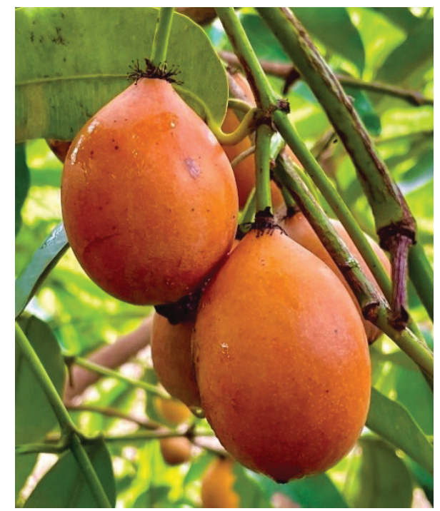
Figure 4. Achachairú fruit on the tree.

While there is significant phenotypic variation in achachairú trees from different provenances, there are no documented named varieties that are recognized for their unique and consistent characteristics.