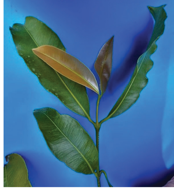
Figure 2. Achachairú leaves with new growth.

Leaves are dark green, opposite, glabrous, coriaceous, elliptical, and lanceolate, with acuminate apices and acute bases. They are approximately 8 inches (20 cm) long, by 2.8 inches (7 cm) wide. New leaves emerge in pairs from the tips of the branches in 2 to 4 irregularly timed flushes during the year. New leaves have an intense copper or crimson color, which changes to light pink, light green, and finally, dark green as the leaves reach their maximum length.