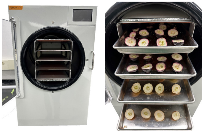
Figure 5. A small-scale freeze-dryer (left) and halved muscadines following drying (right).

Several steps are involved in the freeze-drying process for muscadine fruit (Figure 6):