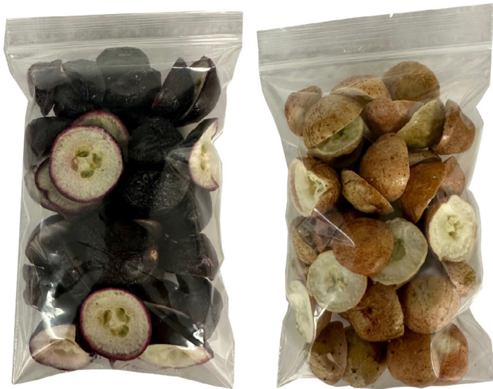
Figure 9. Freeze-dried muscadine fruit halves packed in sealed bags for storage. 'Paulk' (left) and 'GA-13-4-2' (right).