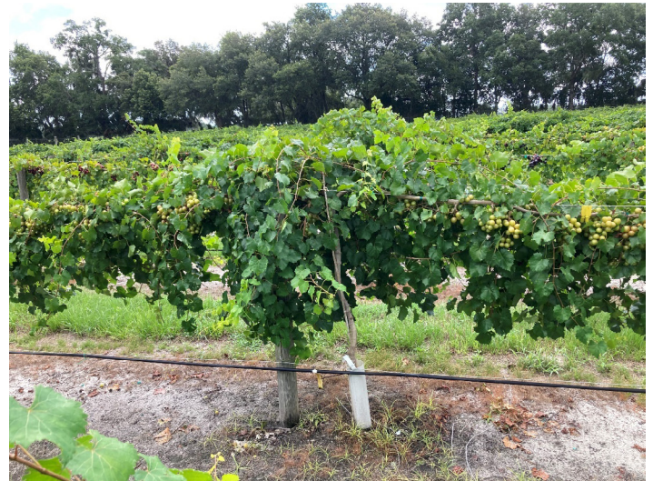
Figure 1. Muscadine vines at the time of harvest in late summer.

Muscadine grape ( Muscadinia rotundifolia [Michx.]) is a fruit crop native to America; it was the first grape species cultivated in the country. Muscadine grapes (Figure 1) adapt well to a wide range of biotic and abiotic stresses and have thus been grown and vinified throughout the southeastern US for centuries. Currently, southeastern farmers grow approximately 5,000 acres of almost 100 improved muscadine-grape varieties for commercial use. Muscadine grapes are commonly consumed fresh or processed into juice, wine, or jam. Recent research demonstrated the fruit's significant contribution of beneficial phytochemicals to the typical American diet; and thereafter, the demand for muscadine grapes considerably increased. Many consumers now consider muscadine grapes a favorable, healthy food due to their unique blend of bioactive compounds and antioxidant properties. Its thick peels and seeds, though, have prevented wider public consumption. This publication aims to introduce growers, Extension agents/specialists, and the general public to the potential for a new, value-added product that makes muscadine grapes much easier to eat and may diversify the food processing industry.