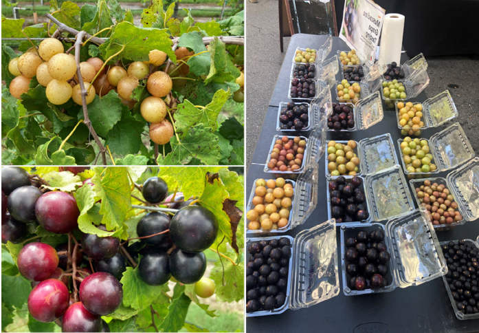
Figure 2. Muscadine grapes on vines (left) and varieties on display in clamshell containers (right).

muscadine peel is a rich source of antioxidants, dietary fiber, flavonoids, and other beneficial phytochemicals including high levels of resveratrol, a polyphenolic compound reported to have antioxidant and anti-inflammatory properties. The fruit's other beneficial compounds include anthocyanins and ellagic acid. Although the anatomy of muscadine grapes is like that of other grape types, its fruit are typically larger, with thicker peels and larger seeds.