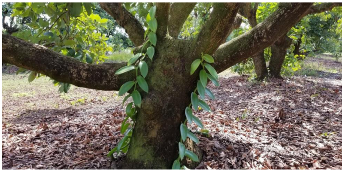
Figure 6. V. pompona growing on an avocado tree. Vines were received as ~1 meter-long cuttings. Growth is after one year without supplemental irrigation.

Vanilla vines require trellising to maximize production. Two major production methods are used. One uses “tutor” trees to provide both shade and a suitable structure on which the vines can climb. Tutor trees can be selected based on hardiness in a given location, availability, and co-cultivation considerations. This type of cultivation can be less expensive in some areas and also naturally reduces the risk of vine death by Fusarium by increasing the distance between plants. Growers in southern Florida should consider vanilla as a secondary crop on existing fruit trees. Figure 6 shows V. pompona growing on an avocado tree. Any agricultural inputs will have to be compatible with both species under the intercropping model.