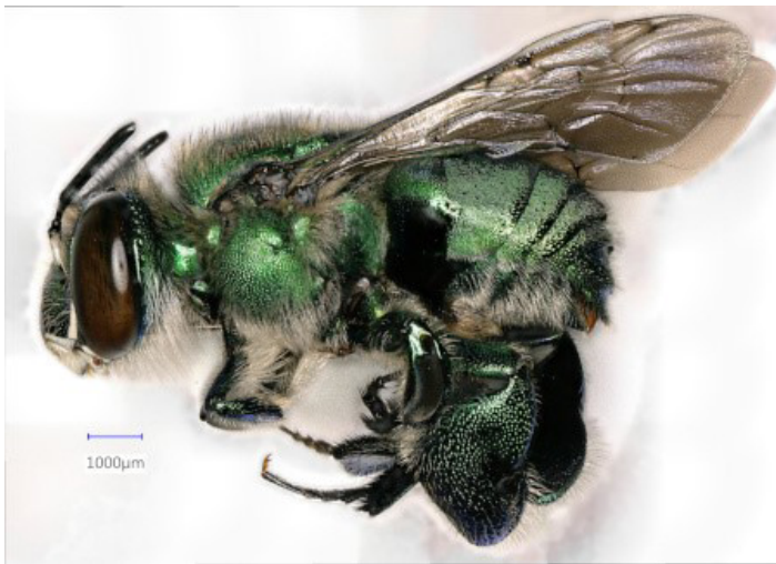
Figure 2. Euglossa dilemma lured and captured at the UF/IFAS Tropical Research and Education center. This bee could be a pollinator of vanilla orchids.

Auto-pollination of V. planifolia flowers is rare to nonexistent in regions where native pollinators (bees and perhaps hummingbirds) do not occur. Though not native, the orchid bee Euglossa dilemma (Figure 2) has become established in southern Florida and could potentially be a pollinator of vanilla orchids. Otherwise, our observations in natural areas show that native vanilla species will set pods in the absence of manual pollination (Figure 3). One hypothesis is that a native orchid pollinator in southern Florida could also pollinate V. planifolia flowers, reducing the need for manual pollination.