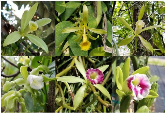
Figure 1. Flowers of V. planifolia (top left), V. pompona (top center), V. phaeantha (top right), V. mexicana (bottom left), V. dilloniana (bottom center), and V. barbellata (bottom right) growing in southern Florida.

as industrialization superseded agriculture. Hawaii received vanilla as part of trade routes before 1900. Hawaii still has vanilla production but mostly favors tourism business models. Records indicate that V. planifolia was imported into Florida from Mexico starting in 1899 (Cook 1899). Additionally, Florida has four native vanilla species ( V. barbellata , V. dilloniana , V. phaeantha , and V. mexicana ) with naturalized V. planifolia (Figure 1). V. pompona is also common among gardens in southern Florida. Puerto Rico has six species growing wild ( V. barbellata , V. dilloniana , V. poitaei , V. pompona , V. claviculata , and V. planifolia ). The native Florida vanilla species are endangered and should not be collected from natural areas without proper authorization and permitting by regulatory authorities.