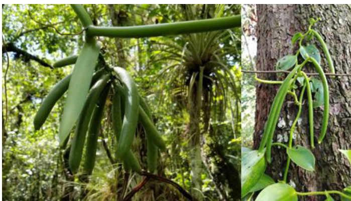
Figure 3. Bean development in the absence of manual pollination for V. phaeantha (left) and V. mexicana (right) in natural areas.