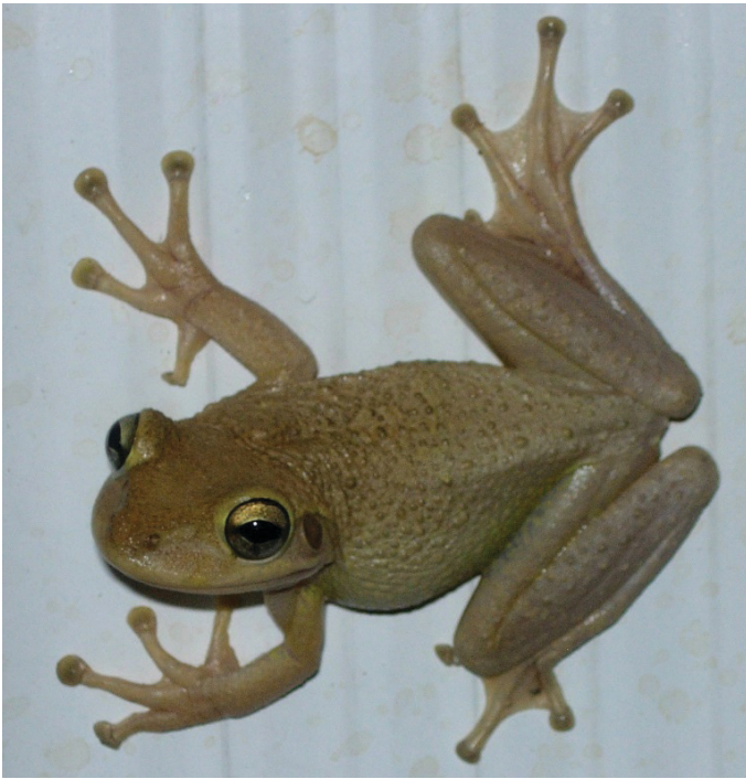
Figure 1. Adult Cuban treefrog.