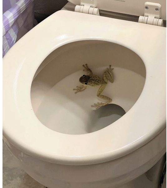
Figure 10. Cuban treefrogs invade buildings and homes and sometimes find their way to toilets.

home's plumbing system through vent pipes on the roof. When Cuban treefrogs gain access through vent pipes of a home plumbing system, they usually end up in a bathroom. There are numerous instances where unsuspecting people have opened the lid to their toilet only to find a bug-eyed Cuban treefrog staring up at them (Figure 10). Cuban treefrogs have also been responsible for clogging sink drains.