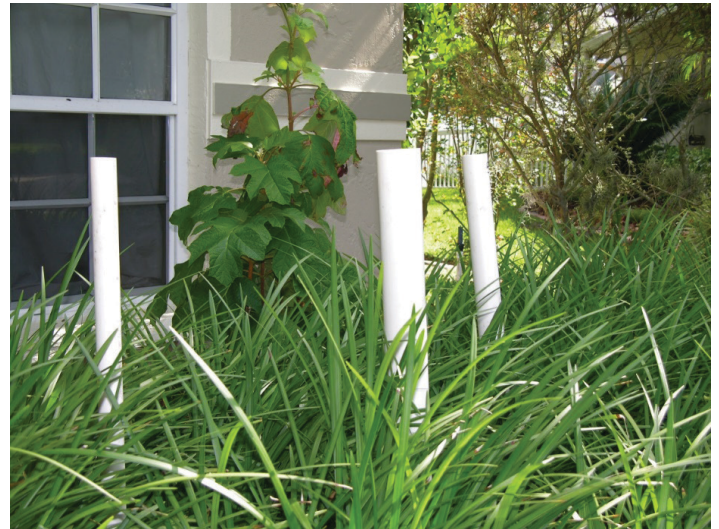
Figure 13. PVC pipes installed in your yard will attract native treefrogs and Cuban treefrogs.

release native frogs back into the pipe. (PVC pipes provide great artificial habitats for native treefrogs and can help enhance the wildlife value of your garden.) For more details on using PVC pipes to attract treefrogs, see the UF/IFAS fact sheet on making treefrog houses ( https://edis.ifas.ufl.edu/uw308 ).