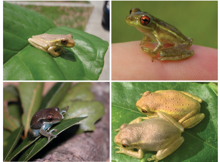
Figure 5. Young Cuban treefrogs vary from brown to green in color and have a light line from their eye to their rear legs, which fades as the frog grows.

feature, the frog should be held up to a light or placed on a white background (Figure 6).