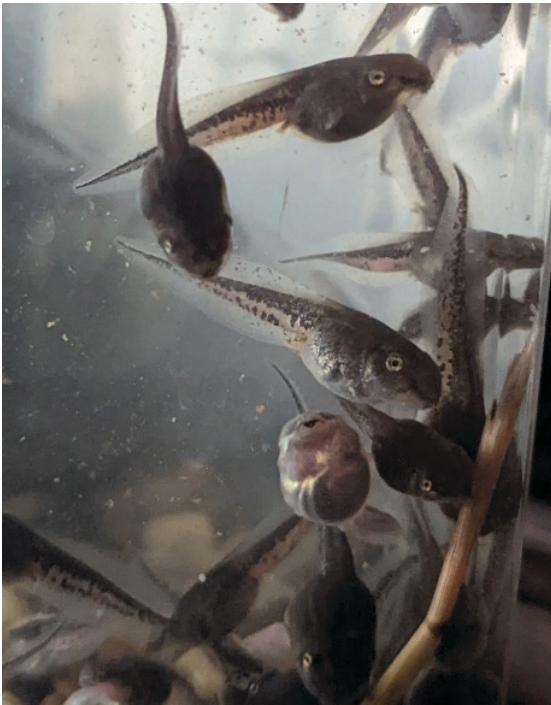
Figure 7. Cuban treefrog tadpoles grow to about 1.25 inches, have eyes on the sides of their heads, and tail muscles that are dark above and light below.

silhouette of a treefrog tadpole when viewed from above. Tadpole size can also help with identification. The tadpoles of bullfrogs and other aquatic frogs can grow to well over 2 inches long including the tail. Cuban treefrog tadpoles attain a maximum length of approximately 1.25 inches. Cuban treefrog tadpoles have a dark brown body, and their tail is mottled with dark blotches and spots. (Tadpole color can change depending on the water color and clarity, so tadpole color alone is not a good feature for identification.) The upper part of the tail muscle is dark, and the lower part is white or cream colored (Figure 7). As described below, Cuban treefrogs often breed in artificial water bodies near human development, so the location where tadpoles are found can assist with identification. Tadpoles fitting the above description and found in small, artificial bodies of water within the range of the Cuban treefrog shown above in Figure 2 are likely Cuban treefrogs.