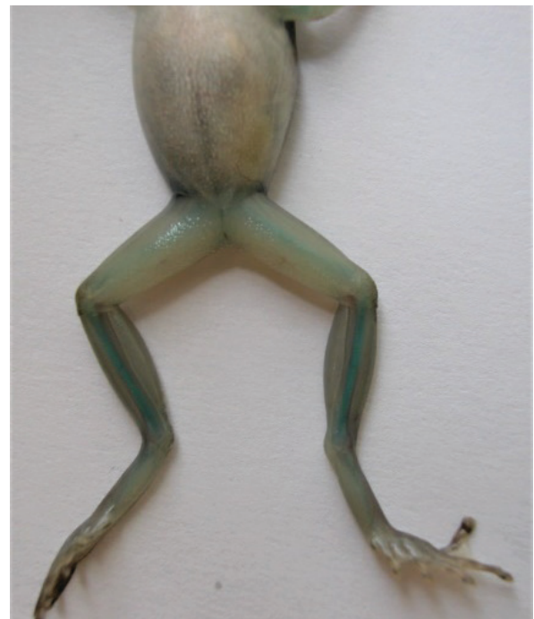
Figure 6. The bones of Cuban treefrogs are blue, a feature most easily seen in juveniles.

Tadpoles of many of Florida’s frogs are inherently challenging to identify, even for experts. However, the location of a tadpole’s eyes on its head can assist with identifying the general type of frog. For example, the eyes of toad tadpoles are located well on top of the head, whereas the eyes of treefrog tadpoles (including Cuban treefrogs) are more lateral and on the side of the head. The eyes make up the