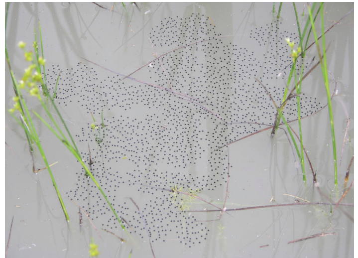
Figure 8. Cuban treefrogs lay their eggs on the water's surface in a film.

Some frogs lay eggs in round masses and some deposit strings of eggs, but Cuban Treefrogs lay their eggs as a film on the water's surface (Figure 8). The eggs look like small, floating black spots and are evenly spaced. They may be in small groups or a large raft, depending on how much they have been disturbed. Cuban treefrogs lay their eggs in small water bodies and often in artificial containers such as buckets, bird baths, ornamental ponds, livestock water troughs, and swimming pools.