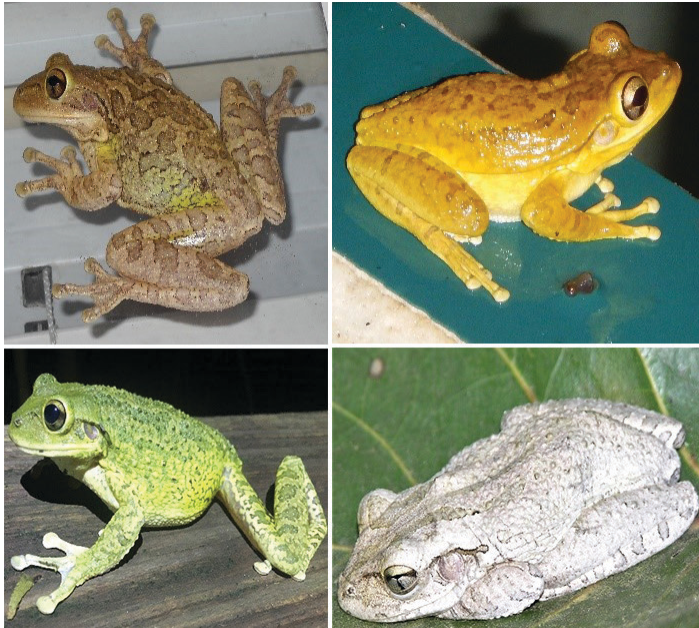
Figure 4. Adult Cuban treefrogs vary a lot in color and pattern.

pattern of large wavy markings or blotches on their back. They frequently have stripes or bands on the dorsal surface of their legs. Once Cuban treefrogs reach a body length of approximately 1 inch, the skin on top of their head becomes tightly fused to the skull.