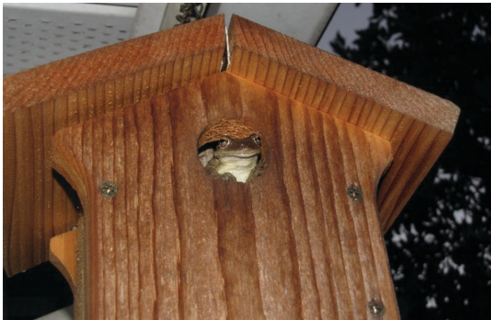
Figure 11. Cuban treefrogs use birdhouses and nest boxes erected to benefit native wildlife.

capturing Cuban treefrogs. Thorough handwashing is also advised after handling Cuban treefrogs.