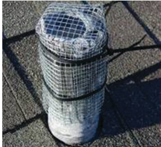
Figure 14. Cover roof vent pipes to keep Cuban treefrogs from invading plumbing systems and showing up in toilets.