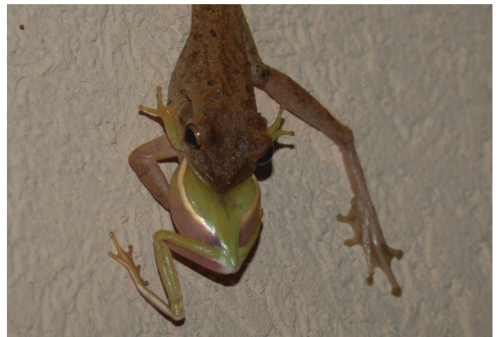
Figure 9. Cuban treefrogs eat Florida's native treefrogs, such as this unfortunate green treefrog.

Cuban treefrogs are having negative impacts on Florida's environment. In both natural and urbanized settings, Cuban treefrogs are known predators of Florida's native treefrogs (Figure 9) and appear to be responsible for declines of some native treefrog species, especially in urbanized areas. Native squirrel treefrogs appear particularly susceptible, likely because their small size makes them highly vulnerable to predation by the larger Cuban treefrogs (Campbell, Campbell, and Johnson 2010). And Cuban treefrog tadpoles will even prey upon the tadpoles of squirrel treefrogs in some situations (Smith 2005b). Researchers found that survivorship of native squirrel treefrog tadpoles declined significantly in the presence of Cuban treefrog tadpoles (Knight, Parris, and Gutzke 2009).