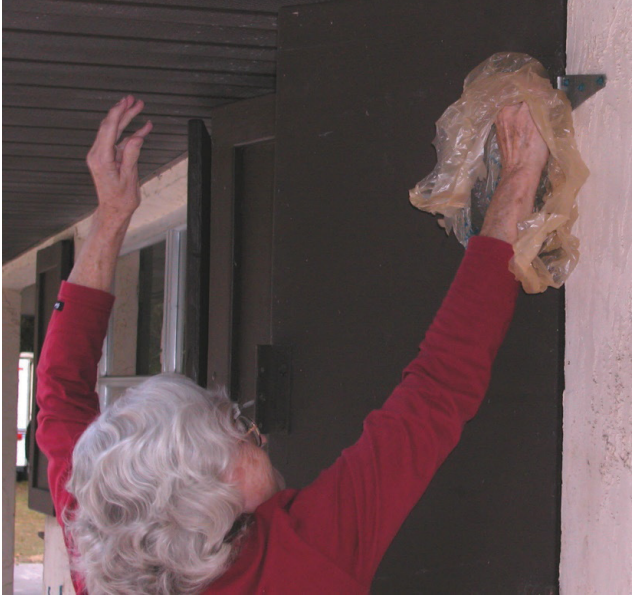
Figure 12. A central Florida homeowner helps manage Cuban treefrogs by capturing and euthanizing this invasive species.

To humanely euthanize a Cuban treefrog, you must first capture it; there are several effective methods for doing this. The first is to simply grab the frog from a window, wall, or other perch site. Be sure to use a plastic grocery bag or similar plastic sack as a glove to capture the frog. Approach quickly and decisively, and with a continuous, swift movement firmly grab the frog (Figure 12). Maintain a firm grip on the frog and then simply tie the bag shut to contain the frog.