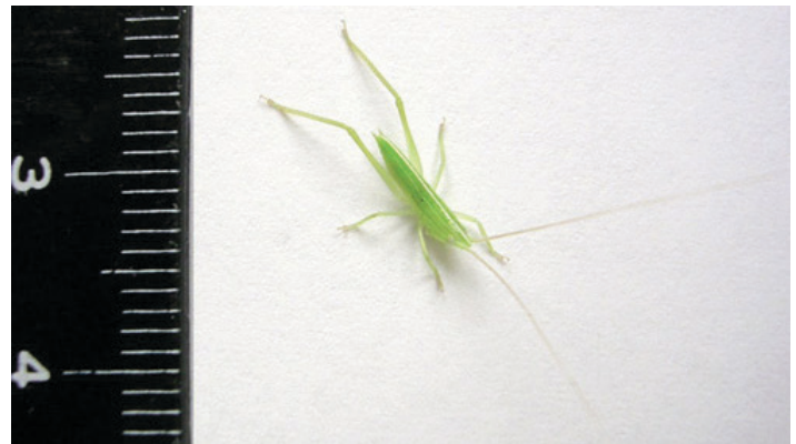
Figure 6. Second instar of Neoconocephalus triops (L.) reared in a laboratory.

spp. are found among grasses, feeding on the grass flowers and developing seeds (SINA 2014c). Nymphs reach adulthood after about seven weeks (Whitesell 1974).