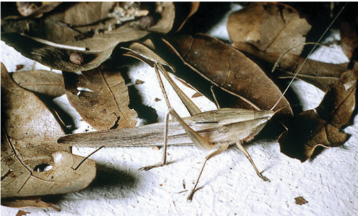
Figure 7. Brown adult male, Neoconocephalus triops (L.), among brown leaves.