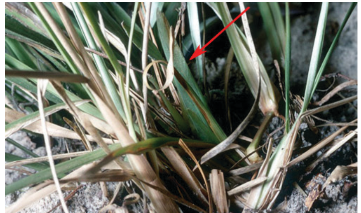
Figure 4. Green Neoconocephalus triops (L.) adult female hidden in grass. Only the forewing (as indicated by the red arrow; altered with permission) and extended hind leg are visible.