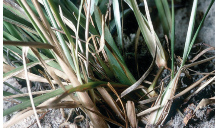
Figure 3. Green Neoconocephalus triops (L.) adult female hidden in grass. Can't find her? Scroll down to Figure 5.

Coneheaded katydids have oversized jaws and a relatively large body, with adult females (except for Belocephalus spp.) generally much larger than males. Their bodies are covered by long, narrow, leathery forewings (SINA 2014a, Capinera et al. 2004). Both adult males and females are strong fliers and tend to be attracted to lights (SINA 2014b). When disturbed, adult coneheads will fly off or dive down into the ground, burying their head to make their body appear as grass (Figures 3 and 4) (Capinera et al. 2004).