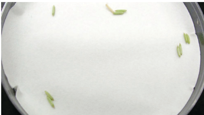
Figure 5. Eggs of Neoconocephalus triops (L.) in a shallow dish.

The eggs are light green in color and are long and oval-shaped with pointed ends (Figure 5). Coneheaded katydids oviposit in grasses in between stems and sheaths of roots or leaves (SINA 2014a). In captivity, oviposition in the soil has been recorded, and the captive-bred hatchlings emerge after about eight weeks (Whitesell 1974). All other Neoconocephalus spp. overwinter as eggs except for the broad-tipped conehead, which overwinters during the adult stage (Capinera et al. 2004).