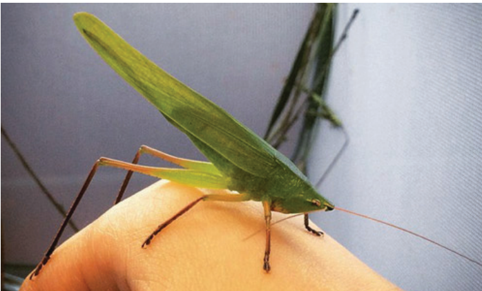
Figure 8. Green adult female, Neoconocephalus triops (L.). Note the ovipositor between the wings.