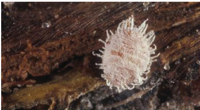
Figure 1. An adult pineapple mealybug, Dysmicoccus brevipes .

Dysmicoccus brevipes , commonly called the pineapple mealybug (Figure 1) or more specifically the pink pineapple mealybug, is a worldwide pest of pineapple crops and a minor pest of many other crops. Its importance as a crop pest of pineapple is tied strongly to its ability to transmit Pineapple mealybug wilt-associated virus to pineapples.