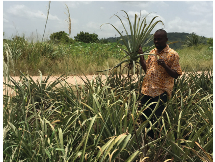
Figure 5. A farmer in Ghana holds up a pineapple plant infected with Pineapple mealybug wilt-associated virus .

weaken the plant, increasing susceptibility to other pests and diseases. Black spot, caused by a fungus, is reported on pineapple fed upon by mealybugs. Black sooty mold and other molds commonly grow in areas exposed to a buildup of honeydew produced by mealybugs. The highest concern for pineapple growers is the pineapple mealybug often vectors Pineapple mealybug wilt-associated virus commonly referred to as pineapple wilt, mealybug wilt, or edge-wilt (Sether et al. 1998) (Figure 5).