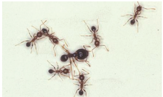
Figure 4. A major Pheidole megacephala worker (center) and several minor workers.

Like many scale insects, the pineapple mealybug is often tended to by ants, which harvest their honeydew as food. In return, the ants herd and protect the insects, even occasionally carrying the pineapple mealybugs to new host plants (Jahn and Beardsley 2000). The primary symbiotic ant species associated with the pineapple mealybug is Pheidole megacephala , commonly known as the bigheaded ant (Petty and Tustin 1993) (Figure 4). In Hawaii, these species are dependent upon each other. Other ant species associated with the pineapple mealybug include Iridomyrmex humilis , Solenopsis geminata , Ochetellus glaber , and others depending on the environment and geography (Rohrbach et al. 1988).