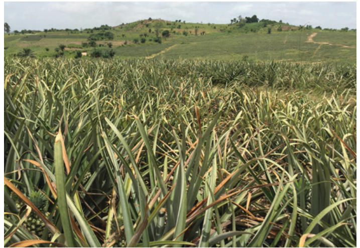
Figure 6. A pineapple field in Ghana with several plants showing symptoms of Pineapple mealybug wilt-associated virus .

Chemicals approved for control of the ants that tend to mealybugs, such as ant baits, have been successful in controlling pineapple mealybug populations (Mau and Kessing 2007). Use only those pesticides approved for use in your area and always follow the directions and precautions on the label.