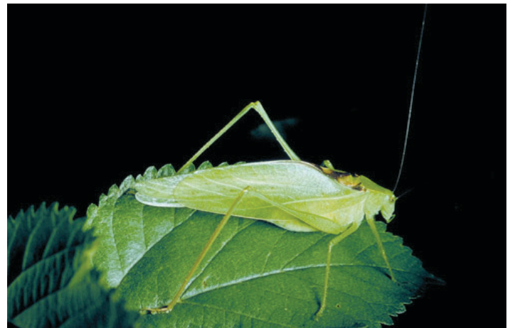
Figure 4. Adult male oblong-winged katydid, Amblycorypha oblongifolia (De Geer), perched on a leaf.

Adult abundance peaks once a year between late June and mid-August depending on the latitude (Capinera et al. 2004). The average adult lifespan is four to six months (Crew 2013).