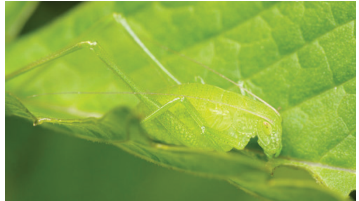
Figure 3. Amblycorypha sp. nymph on a leaf; in Montréal, Québec, Canada.

The wings are not fully formed until sexual maturity is reached, which takes about two months (Crew 2013).