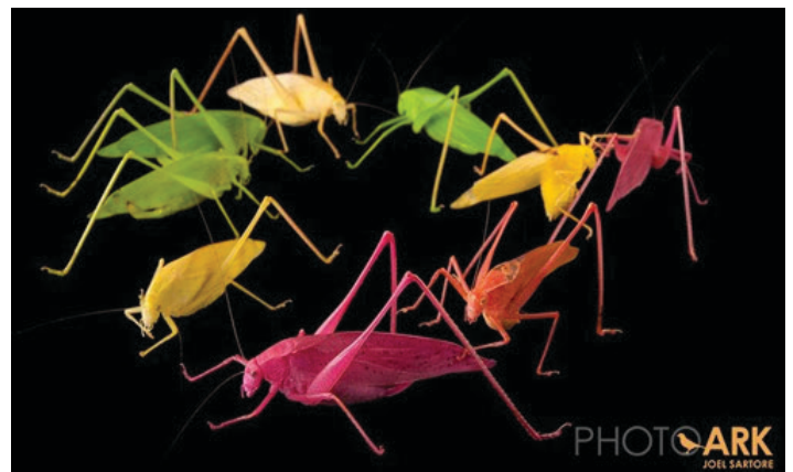
Figure 1. Oblong-winged katydid adults, Amblycorypha oblongifolia (De Geer), in various colors.

This species of katydid is typically green, but can be pink, orange, tan, brown, or yellow (Figure 1), though it is rare to find these in the wild. Though once thought to be a seasonal color change, entomologist Joseph Hancock, in 1916, discovered the colors are a genetically inherited condition called erythrism (Crew 2013).