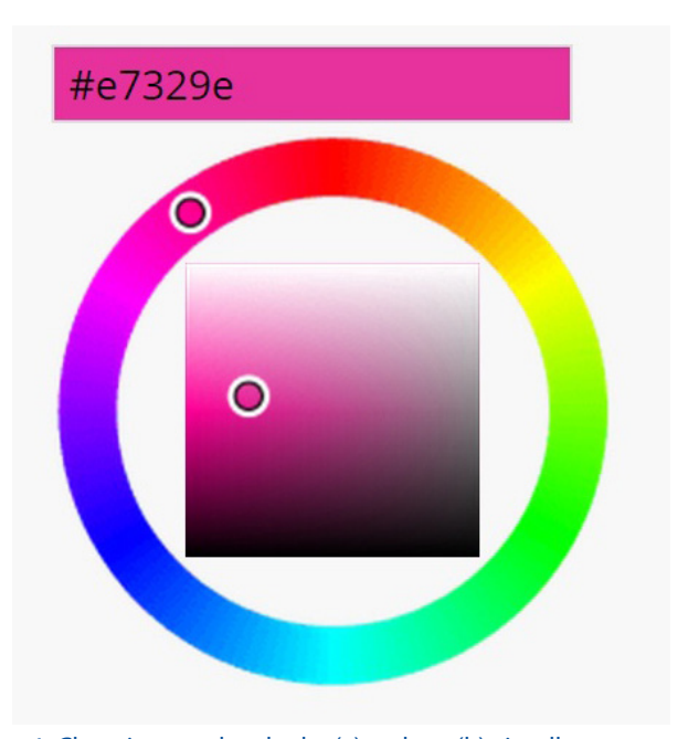
Figure 1. Choosing a web color by (a) code or (b) visually.

The hexadecimal color designation for black is #000000 and for white is #FFFFFF. There are charts that show the hexadecimal values for specific colors. Web-editing programs let you pick colors visually, so you do not need to remember all of them (see Figure 1). If you want to match a specific color on a button to a banner you are adding to a page, you may need to use the specific hexadecimal values, since your eye