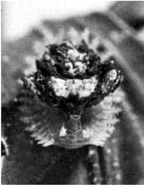
Figure 5. Posterior view of the larva of a clavate tortoise beetle, Plagiometriona clavata (Fabricius), showing last segment bearing the anal fork.