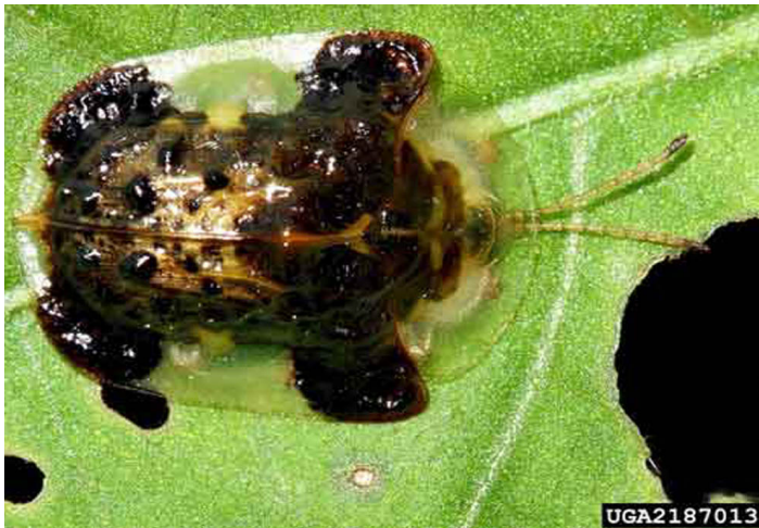
Figure 1. Adult clavate tortoise beetle, Plagiometriona clavata (Fabricius).

Plagiometriona clavata (Fabricius) is common and can be recognized easily by its general form and appearance.