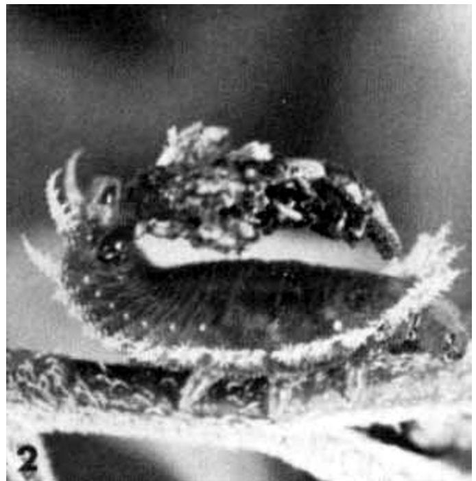
Figure 4. Lateral view of the larva of a clavate tortoise beetle, Plagiometriona clavata (Fabricius). Head of larva is to the right. Anal fork with feces is held above larva.

Larva: The larva is a typical tortoise beetle type, but very unlike most other beetle larvae. The last abdominal segment has a special “fecal fork” which permits the attachment of dried fecal matter. This fecal mass is carried over the dorsum in the same form as trash bugs (Neuroptera), and presumably offers a degree of protection through camouflage. The body is green, flattened, and almost entirely fringed with whitish multispiculate projections.