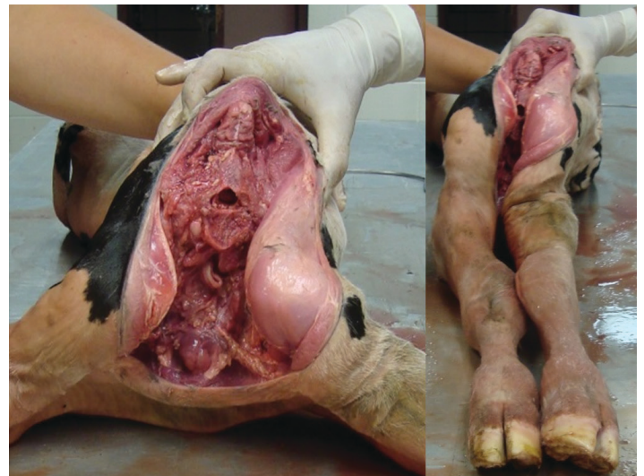
Figure 4. Shoulder collapse after decapitation and neck amputation. Credits: Myriam Jimenez, edited by Klíbs Galvão