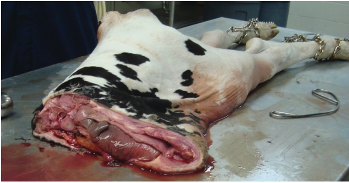
Figure 6. Evisceration after thoracic cut.