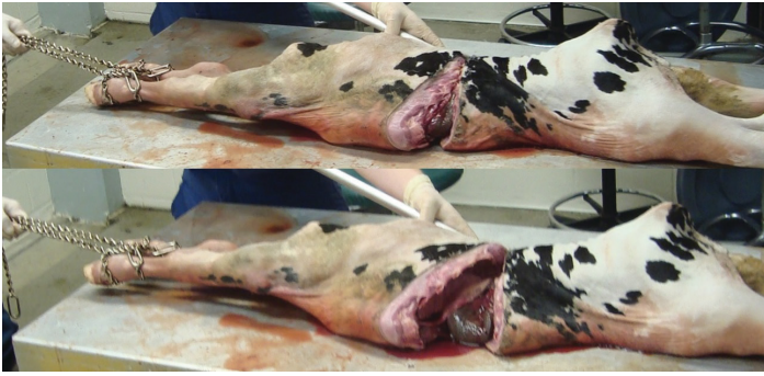
Figure 5. Thoracic cut. Credits: Myriam Jimenez, edited by Klíbs Galvão