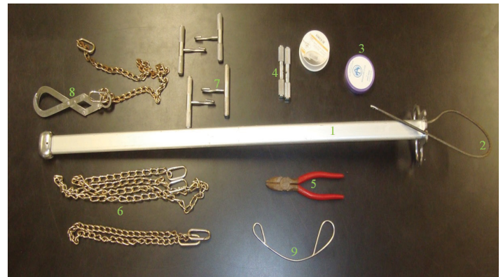
Figure 1. Obstetric tools required to perform a fetotomy in cattle: (1) fetotome, (2) obstetrical wire threader, (3) obstetrical wire, (4) obstetrical wire handles, (5) wire cutting pliers, (6) obstetrical chains, (7) obstetrical handles, (8) Krey's hook with chain, and (9) obstetrical wire guide.

Figure 1 shows the tools required to perform a fetotomy.