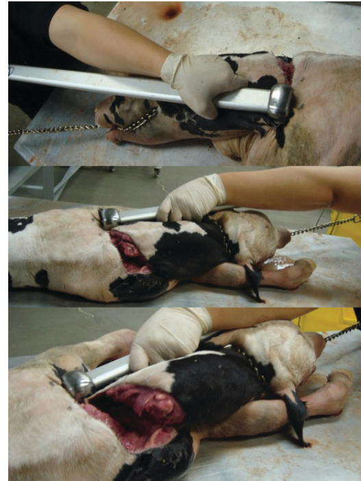
Figure 3. Decapitation and neck amputation.

Usually one person holds the fetotome in place while another person performs the cut (Figure 3).