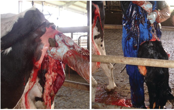
Figure 9. Delivery of a calf with a perosomus elumbis defect.