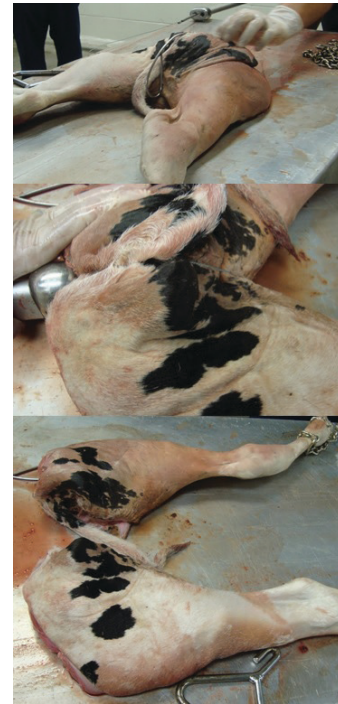
Figure 8. Pelvic bisection. Credits: Myriam Jimenez, edited by Klíbs Galvão