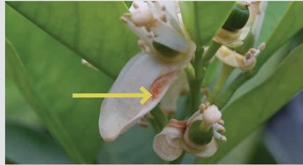
Peach to reddish brown necrotic spots on petals