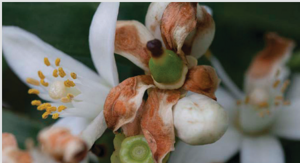
Diseased petals are dark brown to orange and dry first in the affected areas