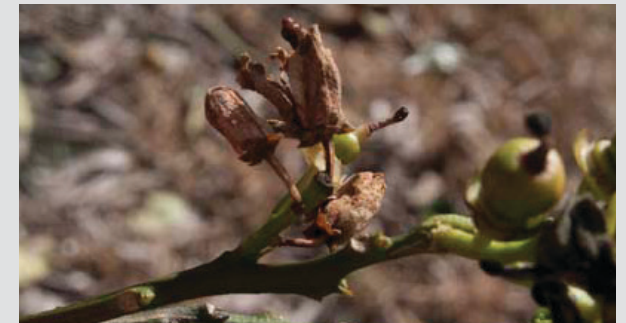
Petals shriveled from PFD