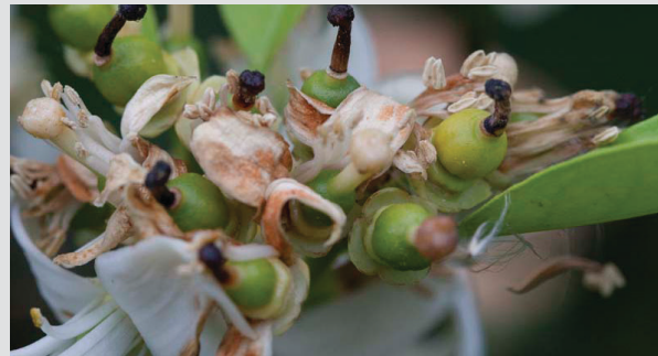
Older petals affected by PFD