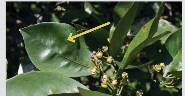
Leaf twisting caused by PFD