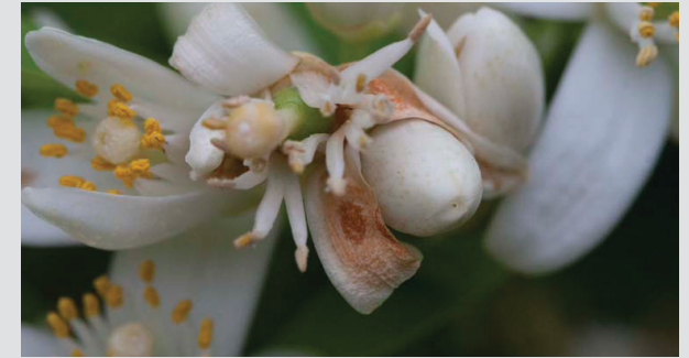
Petals affected by PFD