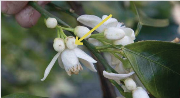
Early symptoms of PFD