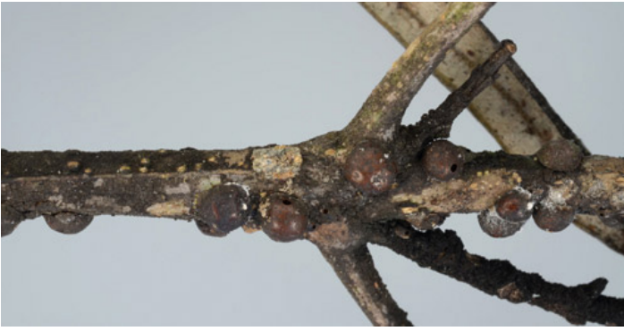
Figure 4. Sooty mold on cultivated olive ( Olea europaea L.) leaves and stems indicates the presence of adult black scales, Saissetia oleae (Olivier).