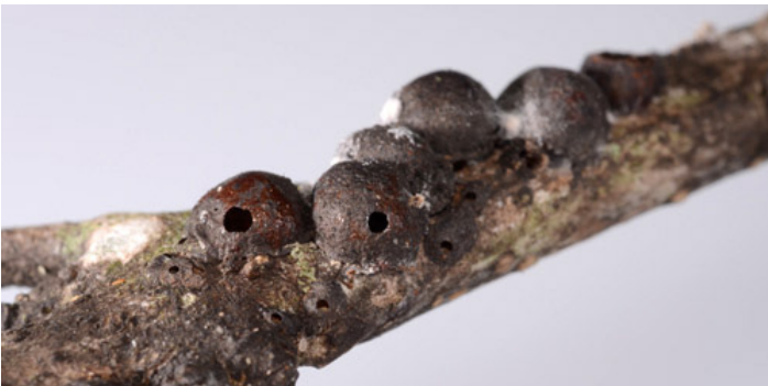
Figure 5. Exit holes in adult black scales, Saissetia oleae (Olivier), indicating the presence of the parasites that aid in black scale control.

The primary method of black scale management is biological control. Classical biological control is a strategy commonly used for invasive pests and involves importation of the invasive pest's natural enemies from the pest's native region. The parasitoid wasps Metaphycus helvolus (Compere) and Metaphycus lounsburyi (Howard) (Hymenoptera: Encyrtidae), also native to South Africa, have been released for control of black scale in olive and citrus fields (Figure 5). Though closely related, parasitoids differ in their life histories. Metaphycus helvolus attacks second or third instar black scale nymphs whereas Metaphycus lounsburyi parasitizes third instar nymphs and adult females. These parasitoids are typically released for augmentative control of the black scale, though some established populations have been reported.