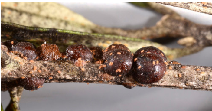
Figure 1. Adult female black scales, Saissetia oleae (Olivier) on cultivated olive ( Olea europaea L.).

The black scale, Saissetia oleae (Olivier, 1791) (Hemiptera: Coccidae) is an important pest of citrus and olive trees. Originally from South Africa, this scale is now distributed worldwide. In Florida, black scale is found on citrus ( Citrus spp.), cultivated olive ( Olea europaea L.), avocado ( Persea americana Mill.), and many popular landscape plants. It is likely that black scale, like many invasive pests, was imported to the United States on infested nursery plants. Based on their small size and the unique life history of scale insects, these insects are difficult to detect and control.