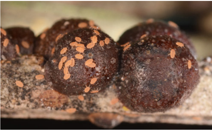
Figure 2. Nymphs of the black scale, Saissetia oleae (Olivier) crawling on adult females and on cultivated olive ( Olea europaea L.).

plant. Crawlers may establish on the leaves ( Figure 3 ), fruit or young woody parts of the host plant, and once settled they insert their mouthparts into the plant tissue and begin feeding. They undergo two molts before maturing into the adult stage and moving to older woody parts of the plant to feed. The body of adult female black scales continues to expand and eventually hardens into a shell-like structure that serves to protect the eggs and nymphs. Adults rarely move from their established feeding site, typically on woody plant material. Under heavy infestations, females may develop on the lower leaf surfaces of the host plant.