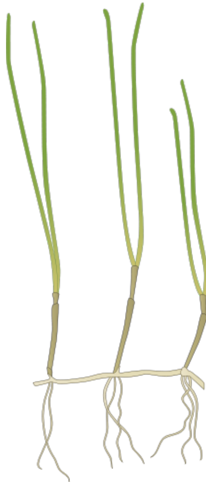
Figure 3. Manatee grass

Manatee grass leaves look like green spaghetti! The leaves are rounded and can be rolled in your hands. Manatee grass has tiny flowers, but they are very difficult to see.