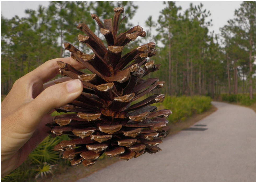
Figure 6. Longleaf pine cone