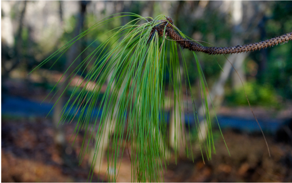
Figure 5. Longleaf pine needles

Pine trees have long, thin needles instead of leaves. Pine trees can be very tall. They do not have true flowers, but they make lots of yellow pollen. Pine tree seeds grow inside pine cones.