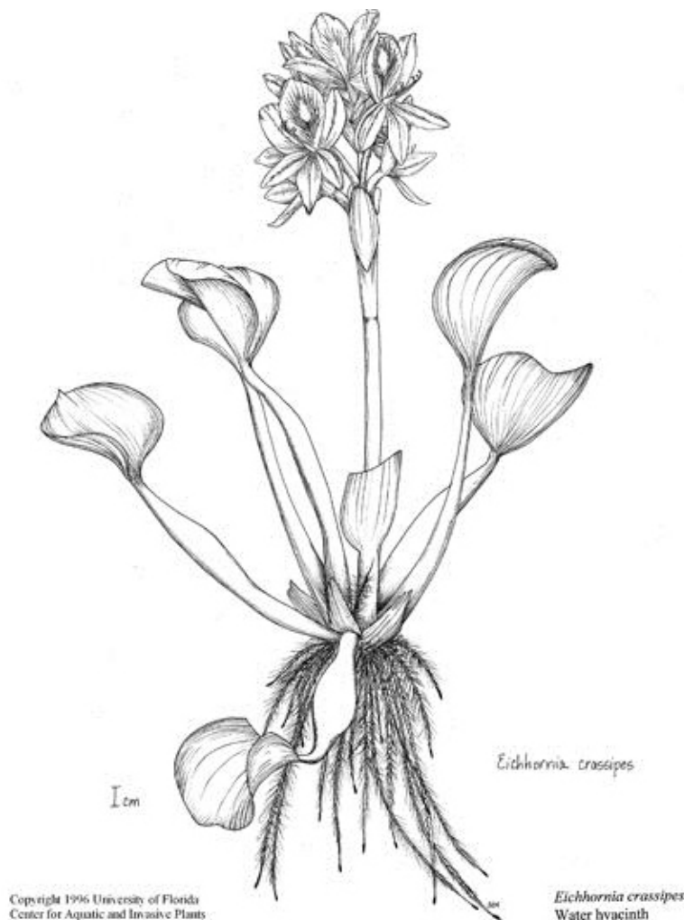
Figure 1. Water hyacinth

Water hyacinth is an INVASIVE plant in Florida. It was brought here from another country, because people thought it was pretty and wanted to have it growing in their ponds. Unfortunately, it ended up in places like the St. Johns River, where it grows and grows and grows, covering the surface of the water in some places. This means that light cannot get into the water, so underwater plants cannot survive. Also, boats cannot get through the thick water hyacinth. Now people are not allowed to bring any more water hyacinth into Florida!