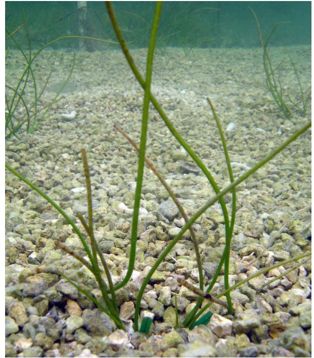
Figure 4. Manatee grass