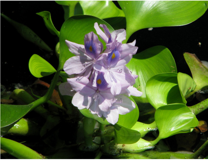
Figure 2. Water hyacinth