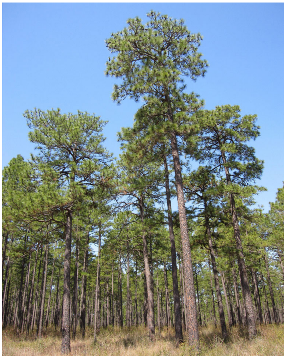
Figure 7. Longleaf pine trees