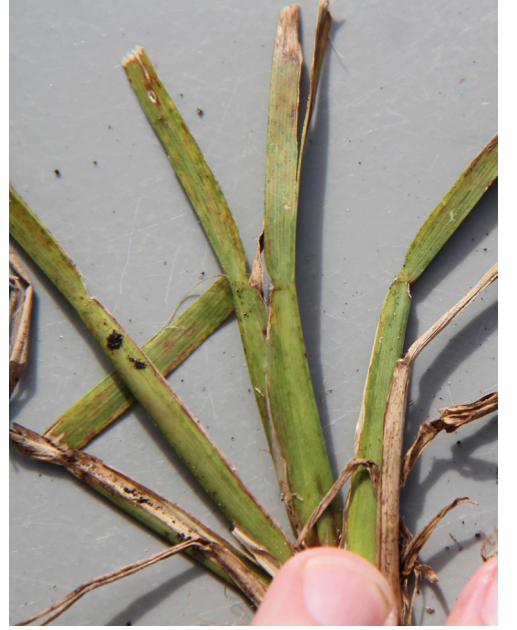
Figure 2. Severe mosaic and necrosis symptoms on St. Augustinegrass infected with Sugarcane Mosaic Virus.

to another viral disease of St. Augustinegrass called St. Augustinegrass decline (SAD, caused by Panicum mosaic virus), but as of November 2014, samples sent to the UF/ IFAS Extension Plant Diagnostic Center have tested negative for SAD and positive for presence of Sugarcane Mosaic Virus (SCMV). SAD is not known to occur in Florida.