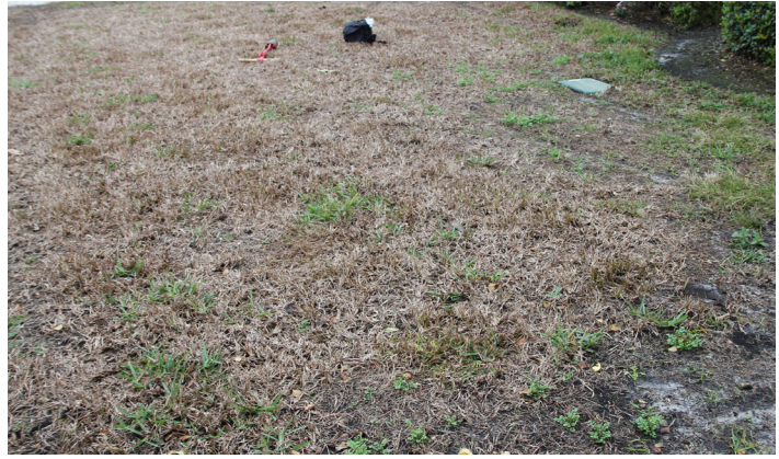
Figure 3. Mosaic disease caused by Sugarcane Mosaic Virus killed this St. Augustinegrass Lawn in Pinellas County, Florida.