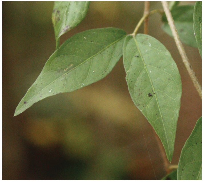
Figure 3. A leaf of cat's-claw vine that has lost its tendril and now consists of only two leaflets.

store energy until they have the resources and opportunity to climb.