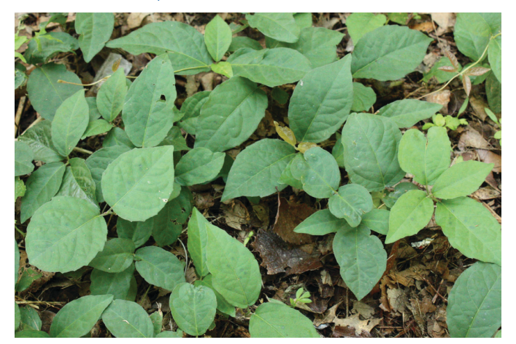
Figure 3.5. A carpet of ground-level cat's-claw plants that have not begun to climb and bear only the simple (or unifoliolate) leaves.

The fruits of cat's-claw vine are long, flattened capsules resembling string beans (Figure 4). They are initially bright green, but they dry to a dark brown and crack open to release around 50 seeds apiece. The seeds are brown and elliptic, with two papery wings that stretch out on either side (Figure 5). Each seed is roughly 4cm long by 1cm wide and only a few millimeters thick.