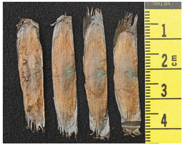
Figure 5. The flattened seeds of cat's-claw vine as they appear at the time of release. Each seed is only a millimeter or two thick. The light weight and the broad, membranous wings allow for effective wind dispersal.