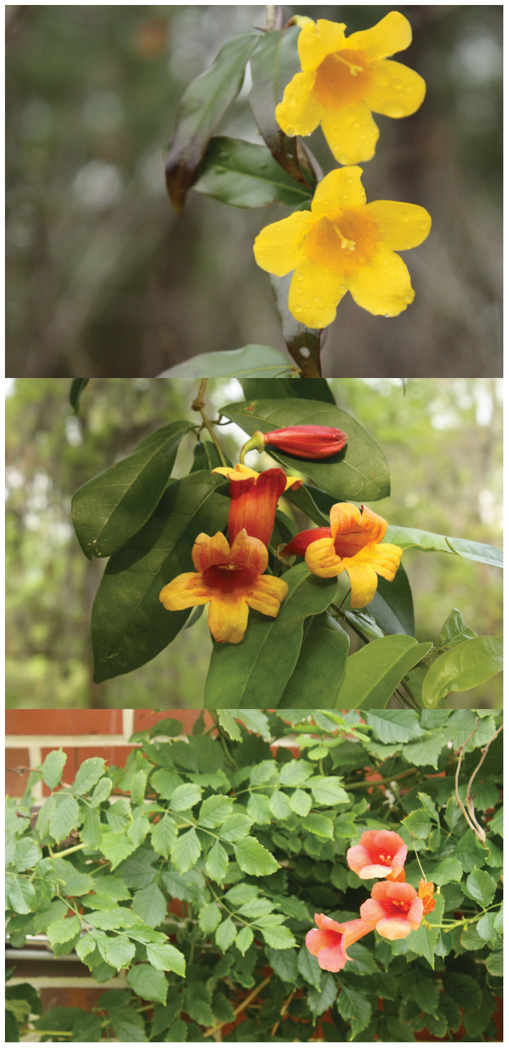
Figure 7. Native vines similar to cat's-claw vine include yellow jessamine (top), crossvine (middle), and trumpet creeper (bottom).