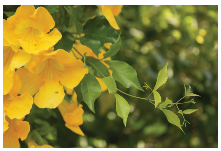
Figure 1. Flowers and leaves of cat's-claw vine. The 3-pronged "claws" that replace the terminal leaflet in each compound leaf are visible at the lower right.