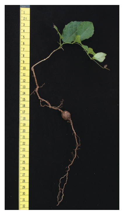
Figure 6. Above- and below-ground portions of a cat's-claw vine showing regrowth after being cut at ground level. The spherical swelling in the taproot contains the plant's energy reserves.