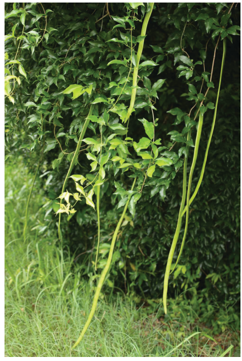
Figure 4. The long, slender fruits of cat's-claw vine hanging from the stems. The fruits are initially green but dry to dark brown in late summer before opening to release the winged seeds.

in the root, rather than the stem, and are therefore more analogous to the swollen, edible portion of a radish or a carrot. Each swelling is 1–2 cm in diameter and can store large energy reserves. One study that looked at several infested sites in Australia found an average density of over 1,000 of these swollen root masses per square meter of forest floor (Osunkoya et al. 2009).