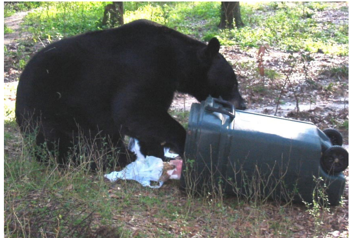
Figure 1. A Florida black bear searching for food. Prevent problems before they start with bear-resistant garbage cans.

Because of their daily calorie requirements, black bears are constantly searching for food. An adult black bear may eat up to 20,000 calories per day, which is about the calorie content of 38 Big Mac sandwiches. Black bears are opportunistic feeders with an excellent sense of smell. A black bear can smell food from one to two miles away. Their sense of smell combined with their need for large quantities of calories attracts black bears to human settlements. Garbage is the main attractant, but bears are also attracted by bee hives, pet food, barbecue grills, fruit trees, and bird (or wildlife) feeders. This means that residential areas provide bears with an easy source of high-calorie foods.