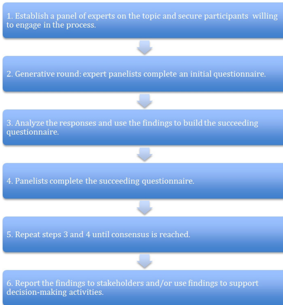
Figure 2. Basic steps in the Delphi process (Geist, 2010; Schindler, 2013).

exist, a common method for analyzing qualitative data is the constant comparative method (Glaser & Strauss, 1967). This analysis requires multiple steps. First, the data are assessed line by line and coded with temporary names, then recoded until categories become well-defined. Second the individual categories are examined to create meaningful relationships with other categories and subcategories. Finally, the researcher may use precise criteria to develop themes or core categories to describe the data (Glaser & Strauss, 1967).