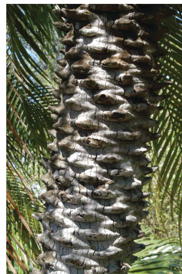
Figure 2. Trunk of pygmy date palm

Pygmy date palms are adaptable to a wide range of soil types. They are considered to be cold hardy to USDA zone 10A (30°F), but are widely grown in zone 9B (25°F). They are not tolerant of salt spray or saline soils. Most pygmy date palms in Florida exhibit potassium (K) deficiency symptoms on their oldest leaves. Symptoms are most severe towards the tips of affected leaves and appear as a yellow-orange discoloration of the leaflets and necrosis of the leaflet tips (Figure 3). Potassium deficiency also causes premature leaf death, so K-deficient palms retain fewer leaves than healthy ones. Potassium-deficient leaves, though unsightly, should not be removed until they are completely dead, as they serve as a supplementary source of K in the absence of sufficient K in the soil. Proper fertilization will