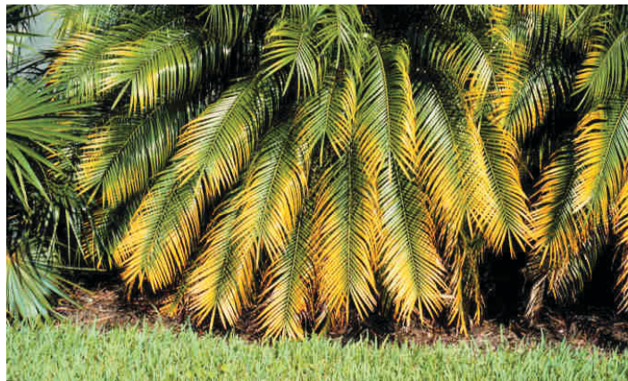
Figure 4. Magnesium deficiency on pygmy date palms

a lack of Fe in the soil, Fe fertilizers may not always be effective in treating the problem. See Iron Deficiency in Palms EP265 .