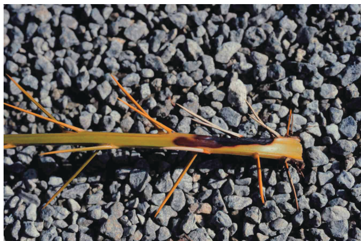
Figure 9. Pestalotiopsis leaf spot on pygmy date palm