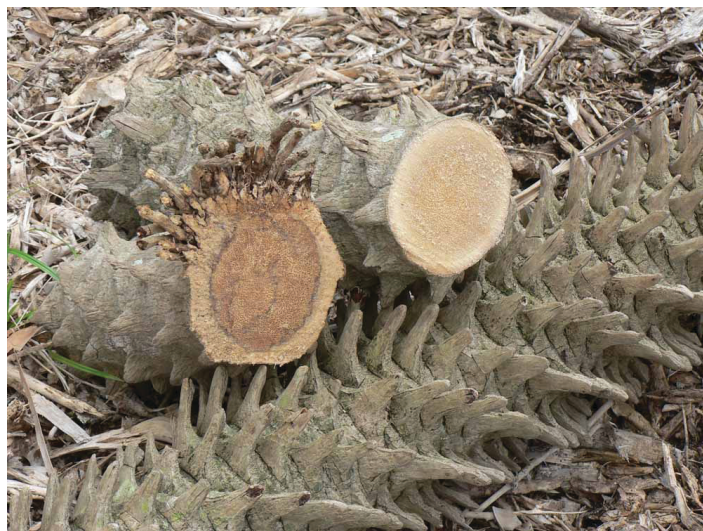
Figure 8. Ganoderma butt rot of pygmy date palm showing discoloration of decayed trunk on left and healthy trunk on right

Pygmy date palms are occasionally damaged by mites and insects such as mealybugs, scales, weevils, and caterpillars. Young leaves of pygmy date palms are normally covered with a whitish material (Figure. 10) that is often mistaken for a whitefly, mealybug, or scale infestation. This material drops off naturally as the leaves age.