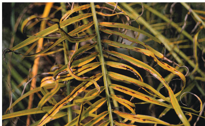
Figure 5. Manganese deficiency on pygmy date palm showing necrotic streaking on leaflets

Manganese (Mn) deficiency is a common problem in pygmy date palms growing in alkaline soils. Symptoms begin as longitudinal necrotic streaks on slightly chlorotic leaflets (Figure 5). As the deficiency progresses, leaflet tips become withered and curled giving the leaves a frizzled appearance (Figure 6). Symptoms of Mn deficiency develop on newly emerging leaves and are most severe towards the base of those leaves. Routine fertilization with the 8-2-12 fertilizer mentioned above should prevent most Mn deficiencies, but severe cases may require supplemental applications of manganese sulfate. For more information about Mn deficiency in palms see EDIS publication EP267 .