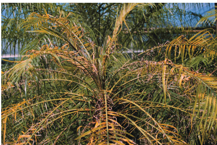
Figure 6. Manganese deficiency on pygmy date palm. Note curling or frizzling of leaflets towards the base of the leaf Credits: T. Broschat