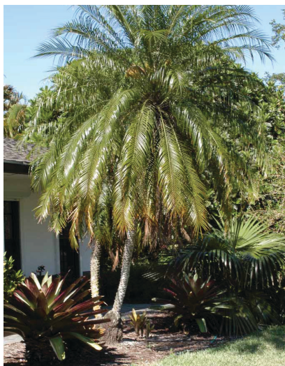
Figure 1. Pygmy date palm

The pygmy date palm is one of the most popular small landscape palms in Florida. It is single-stemmed, but is often grown as clumps of 2–4 closely spaced individuals which, when older, give the impression of a multi-stemmed palm (Figure 1). It grows to a height of about 12 ft, with a spread of 6–8 ft. The feather-shaped (pinnate) leaves have slender petioles and basal leaflets that are modified into sharp 2–3 inch long spines. The slender, often crooked trunk varies in width from 3–6 inches and is covered with distinctive peg-like leaf bases (Figure 2). Older specimens will have a large mass of aerial root initials at the base of the trunk. Cream-colored male and female flowers are found on separate trees (dioecious) in the spring that are followed by small elongated reddish-brown fruits that turn black upon ripening.