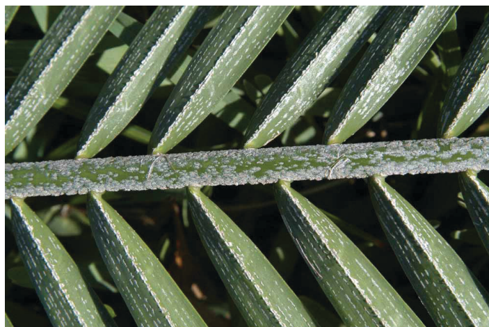
Figure 10. Naturally occurring whitish material on young leaf of pygmy date palm