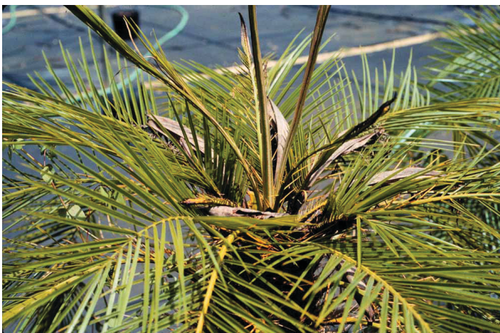
Figure 7. Boron-deficient pygmy date palm showing multiple unopened spear leaves