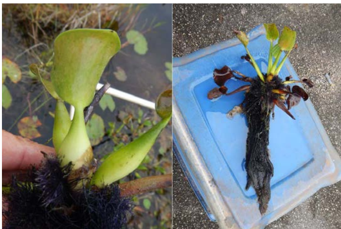
Figure 2. Spongy petioles (left) and dark, feathery roots (right) of waterhyacinth

The leaves of waterhyacinth are thick, glossy, waterproof, and rounded; petioles (leaf stalks) are spongy and inflated when plants have sufficient space to spread out (Figure 2), and thinner and more rigid under crowded conditions. The leaves are attached at the base of the plant to form a rosette. The long, feathery roots of waterhyacinth are dark purple to black and hang beneath the rosette of leaves (Figure 2). Waterhyacinth produces a spike inflorescence that can be up to 20" tall with 15 or more large, showy individual flowers that are up to 3" tall. Flowers have six lavender-blue to purple petals, and the uppermost petal is marked with a yellow "eye-spot." Although individual flowers only last one or two days, the spike may be showy for as long as a week because a few flowers are open each day (Flora of North America 2014).