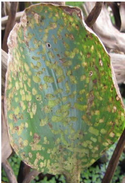
Figure 5. Biocontrol insect feeding damage on waterhyacinth

mentioned earlier, waterhyacinths clogged the St. Johns River for decades after the species' introduction and were brought under control only when synthetic herbicides were discovered in the 1940s. As of 2014, there were 14 herbicide active ingredients labeled for use in aquatic systems in Florida (UF IFAS CAIP 2014). Herbicide selection is based on water use, selectivity (to reduce damage to desirable native plants growing nearby), and cost. A number of herbicides can be applied as foliar sprays to selectively control waterhyacinth. Contact herbicides—including diquat, flumioxazin, and endothall—are quickly absorbed by plant tissue and are fast-acting, whereas systemic herbicides—including 2,4-D, glyphosate, imazamox, penoxsulam, and bispyribac—provide slower but effective