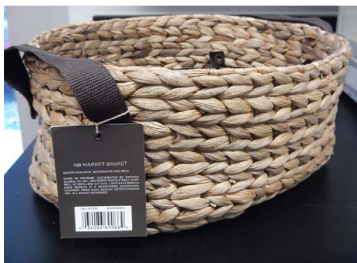
Figure 3. Basket made from waterhyacinth

The prolific growth of waterhyacinth has caused enterprising individuals to wonder whether the species could be used for any number of economic purposes. For example, in 1897, Webber indicated that waterhyacinth could be used as a fertilizer or soil amendment and as a feed for hogs and cattle. It has been evaluated as a cellulose source