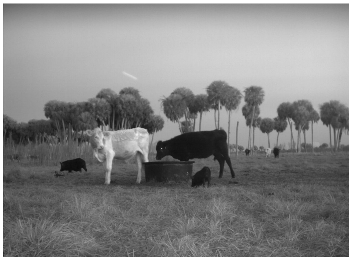
Figure 2. Remotely triggered camera picture of feral swine and cattle near feed tubs on a ranch in south central Florida.

Pseudorabies is a fatal disease in dogs and cats. Symptoms are similar to rabies including excessive salivation, scratching that can lead to self-mutilation, and a lack of coordination or paralysis, but animals infected with pseudorabies will not display an aggressive behavior as do rabid animals (Thiry et al. 2013). There is no vaccine to prevent pseudorabies in cats or dogs.