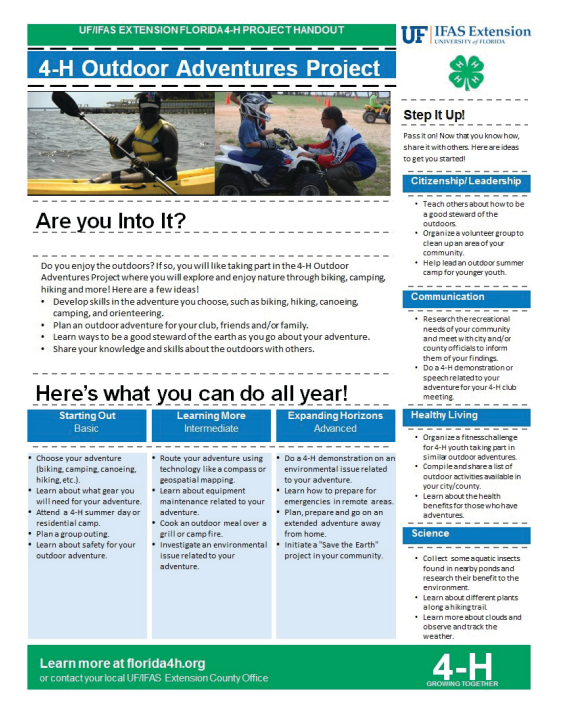
Figure 1. Example of a 4-H Project Handout available online

on awards and recognition. Couple this information with all of the opportunities available in your county and you will see much is offered to help 4-H members to develop subject-matter skills and life skills.