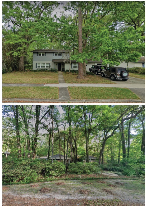
Figure 2. Representative yards in Suburban Heights (A) and West Hills (B) neighborhoods.

Given the results of this study, we make recommendations on how homeowners and other city decision makers can provide breeding habitat for pileated woodpeckers, northern parulas, and summer tanagers.