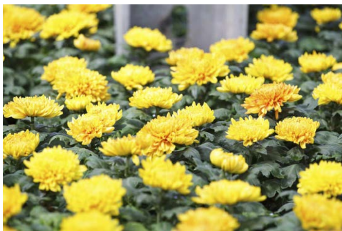
Figure 4. Pyrethrins are extracted from a Chrysanthemum species.

Many insects are susceptible to low concentrations of pyrethrins. The toxins cause immediate knockdown or paralysis on contact, but insects may metabolize them and recover if a synergist is not used. Pyrethrins break down quickly, have a short residual, and have low mammalian toxicity, making them among the safest insecticides in use. However, they cause allergic skin reactions in some people, and cats are highly susceptible to poisoning (e.g., flea drops and powder). Pyrethrins are toxic to fish, so use care when applying these products near water sources.