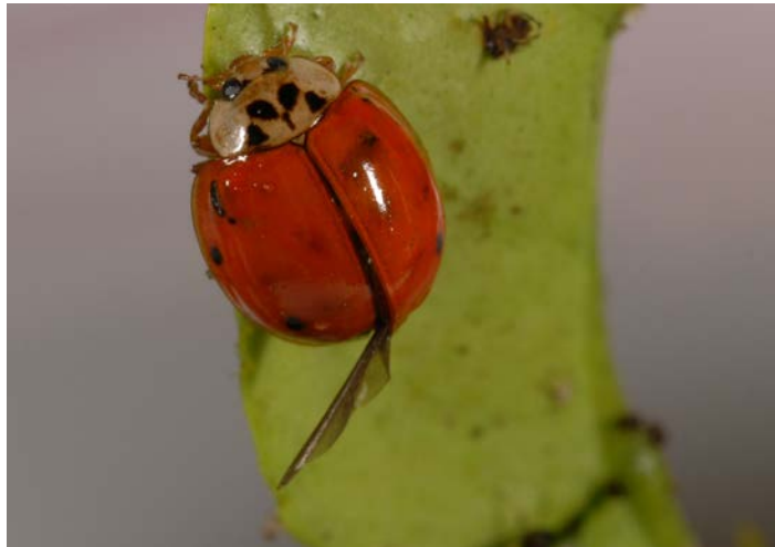
Figure 1. Harmonia axyridis beetle, a beneficial insect

controls, use of resistant plant varieties, and biological control (Figures 1 and 2).