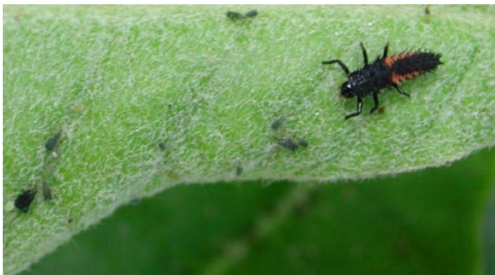
Figure 2. The larva of a species of ladybird beetle, a beneficial insect.

However, data on effectiveness and long-term (chronic) toxicity to mammals are unavailable for some natural products. Tolerances for residues on food crops have not been established for many products.