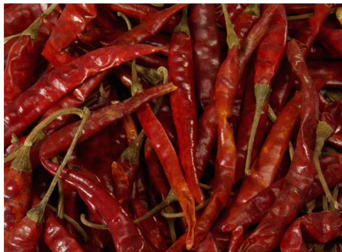
Figure 5. Hot pepper products containing capsaicin claim to repel certain insects.

The flavor does not affect the taste of fruits or vegetables that have been treated.