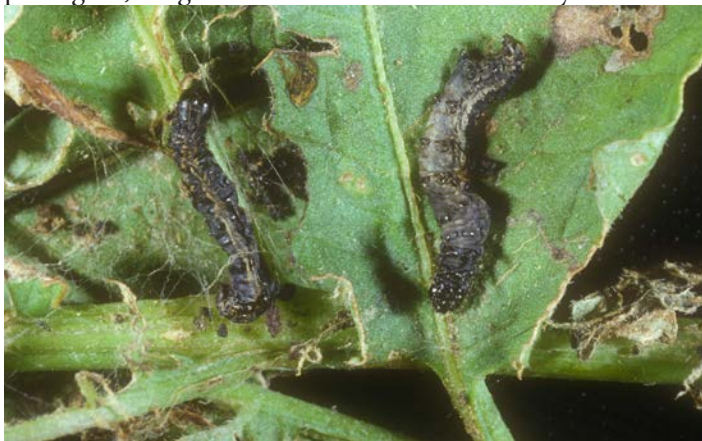
Figure 6. Webworm caterpillars killed by Bt var. kurstaki .

Fungi thrive when high rainfall and humidity favor the germination of fungal spores. After germination, spores penetrate insect bodies. The insects die from the toxins produced by the fungi. Thus, unlike bacterial and viral pathogens, fungi do not need to be consumed by the insect.