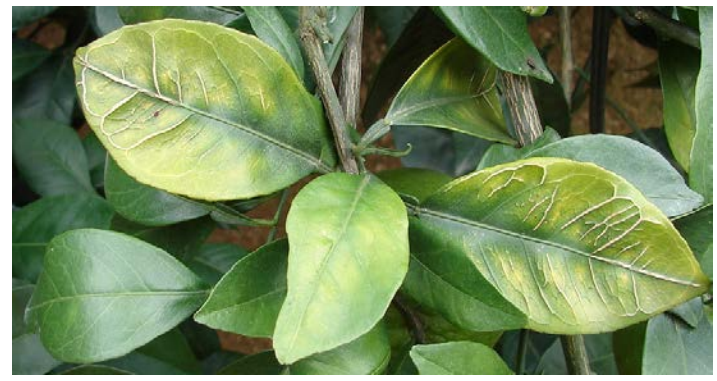
Figure 3. Boron deficiency—Corking and enlargement of the upper surface of the main veins and leaf chlorosis.