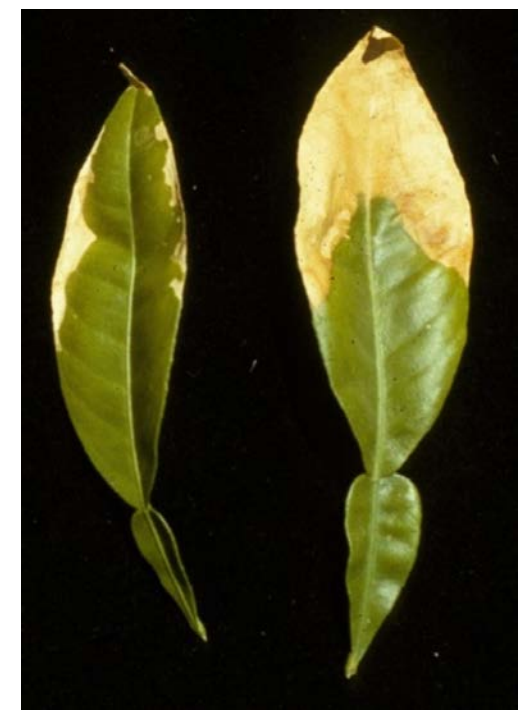
Figure 5. Chloride toxicity—Leaf burn progresses from the tip down along the edges as severity increases.