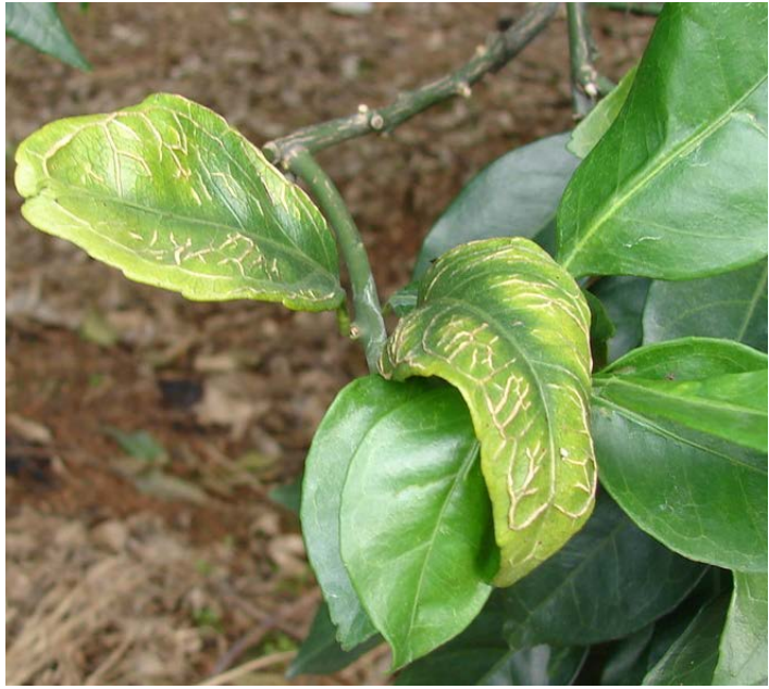
Figure 2. Boron deficiency—Thickening of the leaves, vein splitting, a tendency for the leaves to curl downward, and chlorosis.

and at times chlorosis (Figure 2). Boron deficiency also tends to cause corking and enlargement of the upper surface of the main veins (Figure 3). A premature shedding of leaves beginning at the treetop that soon renders the tree almost completely defoliated is also associated with this symptom. Fruit symptoms are the most consistent and reliable tool to diagnose B deficiency. Boron deficiency is associated with citrus greening (HLB) disease. It is likely caused by restrictions of nutrient uptake and/or transport.