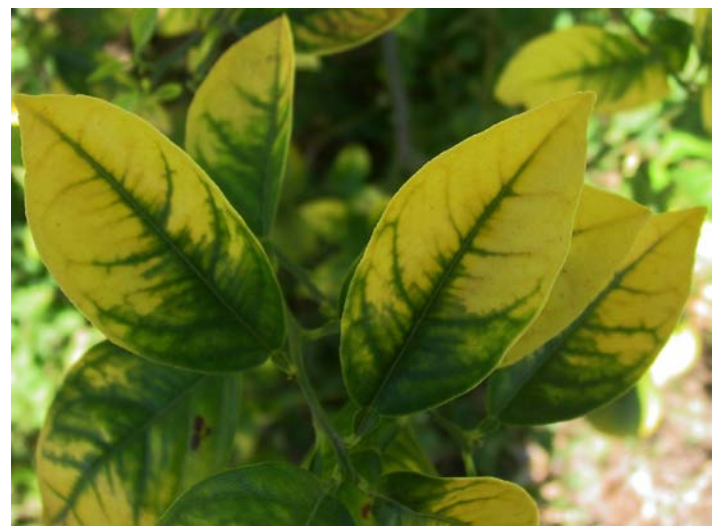
Figure 4. Boron toxicity—Chlorotic areas from the tip expand and extend along the leaf margins.

occurs. The new growth flush following partial defoliation will also show symptoms if toxic levels of B are still present. In severe cases, leaf drop can be extensive, leading to total defoliation, dieback, reduced cropping, and tree death. Because B accumulates progressively as citrus leaves age, the apical mottling is usually more pronounced in late summer and fall. Toxicity due to high B levels in the soil can be reduced by leaching the root zone with low-B irrigation water. Liming of acid soils has also been found to be effective. Boron toxicity can be prevented by exercising care to apply no more than the recommended fertilizer rate.