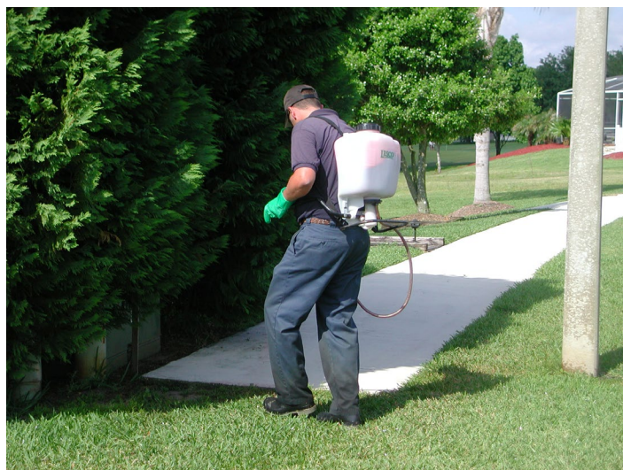
Figure 7A. Various methods of applying pesticides: (A) backpack sprayer