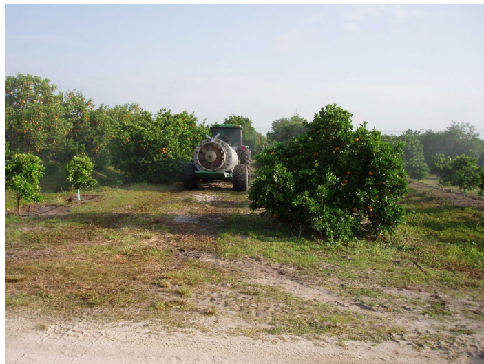
Figure 7D. (D) air-blast sprayer

Do not contaminate water: Bees require water to cool the hive and feed the brood. Avoid contaminating standing water with pesticides or draining spray tank contents onto the ground, creating puddles to which bees may be attracted. Be mindful that contaminated water can also come from drip irrigation being used for chemigation (application of