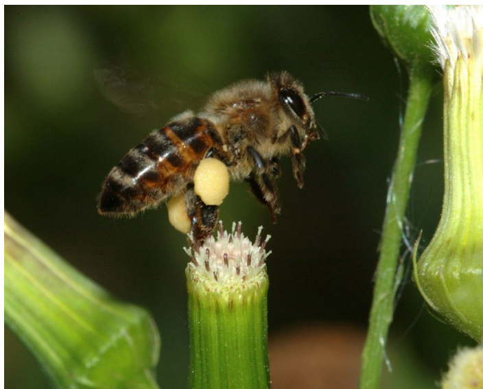
Figure 3. Honey bees collect pollen from flowers and pack it on their back legs to take back to the colony to consume. The flower is pollinated as a result.

hive, and their principle job is to provide sperm to virgin queens. The vast majority of the bees in a colony are female workers. As the name suggests, they are responsible for doing all the work in the hive, including, but not limited to, foraging and processing food, caring for the brood or young bees, defending the colony, and maintaining the colony's temperature. While developing, all three types of honey bees pass through a larval (feeding) stage followed by a pupal (transformation) stage. A fully developed adult bee emerges after the pupal stage but does not leave the hive to forage until its hive duties are complete. Hive bees (the younger workers) build wax, care for the brood, cap cells, process pollen and nectar gathered in the field by older workers, and clean the nest. Eventually, they become field bees (the older workers). Field bees, or foragers, actively collect nectar, pollen (Figure 3), water, and propolis (sap or other resinous materials secreted by plants). See http://edis.ifas.ufl.edu/in1005 for more information on the honey bee life cycle.