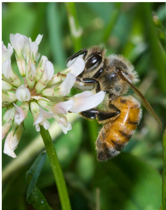
Figure 1. The western honey bee, Apis mellifera , collecting nectar from a flower.

are more than 315 species of wild/unmanaged bees in Florida that play a role in the pollination of agricultural crops and natural and managed landscapes. These include mining bees, mason bees, sweat bees, leafcutter bees, feral honey bees, and carpenter bees, among others.