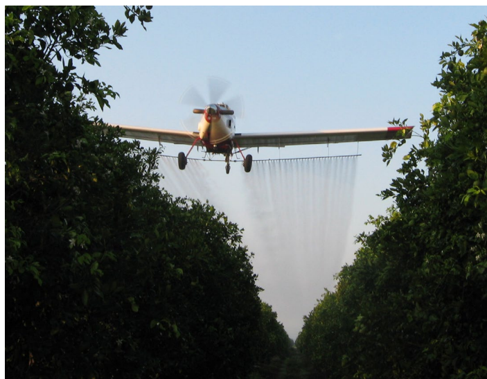
Figure 7E. (E) a plane sprayer

pesticides through the use of irrigation), run off, improper storage or spills, irrigation ditches, and leaking pipes.