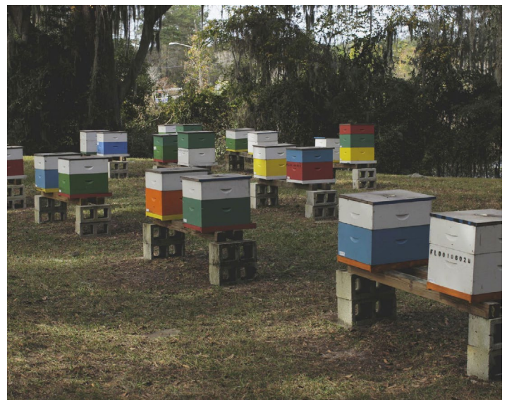
Figure 9. Properly managed hives should be maintained by the beekeeper. FDACS-DPI developed management recommendations for honey bee colonies. They can be found at http://www.freshfromflorida.com/Divisions-Offices/Plant-Industry/Bureaus-and-Services/Bureau-of-Plant-and-APIary-Inspection/APIary-Inspection .