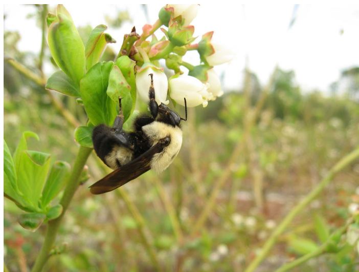
Figure 2. A bumble bee ( Bombus spp.) collecting nectar from a blueberry flower.