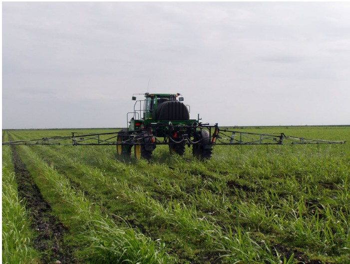
Figure 7B. (B) boom sprayer

avoiding applications during windy conditions, and using windbreaks, hedgerows, and vegetative buffers around crops. These activities will reduce the incidence or severity of honey bees' exposure to pesticides and aid in protecting non-managed pollinators. Although the above rules of thumb can be helpful, remember, ultimately you are responsible for complying with the specific label instructions of the pesticide product you are using. More detailed information on tactics to minimize drift may be found in http://edis.ifas.ufl.edu/pi232 .