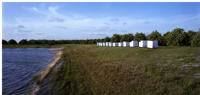
Figure 4. Honey bee colonies placed next to a citrus grove to produce a citrus honey crop. Bee exposure to pesticides can occur when they drink water, such as that in the irrigation pond shown in this figure, or when foraging on the crop.