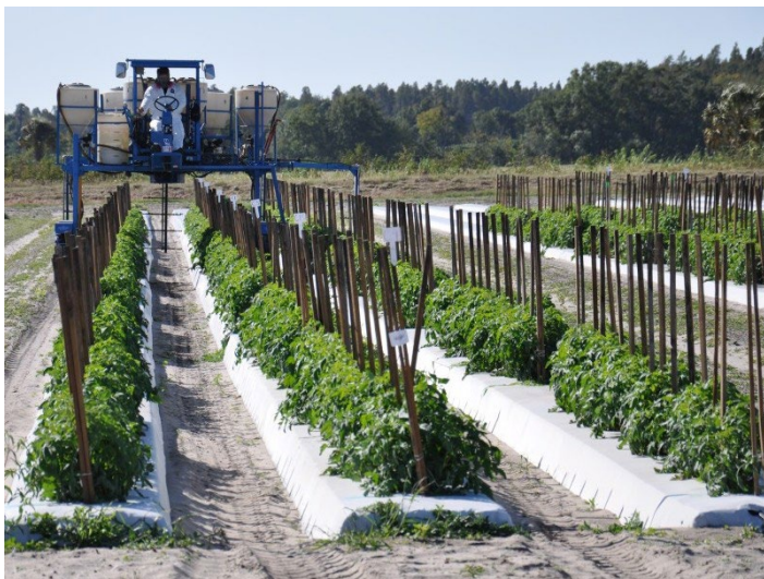
Figure 7C. (C) high clearance sprayer

Do not contaminate water: Bees require water to cool the hive and feed the brood. Avoid contaminating standing water with pesticides or draining spray tank contents onto the ground, creating puddles to which bees may be attracted. Be mindful that contaminated water can also come from drip irrigation being used for chemigation (application of