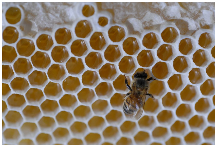
Figure 5. Nectar stored in the wax comb. The nectar will “ripen” into honey, which is consumed by the bees as their carbohydrate source.

Honey bees collect nectar and pollen and consume honey (a nectar derivative, Figure 5) and bee bread (a pollen/nectar mixture stored in combs and later fed to developing bees, Figure 6) as food. Digestion of contaminated bee bread and honey can lead to contaminated secretions, including both wax and royal jelly. Contaminated bee bread and honey are mixed into brood food, which is composed of glandular secretions of worker bees, and fed to developing larvae. Wax is used to construct the hexagonal cells (the “comb”) in which queens lay eggs, the brood develops, and honey and bee bread are stored. Beekeepers who repeatedly use contaminated comb will continue to expose bees to varying levels of pesticides and their metabolites (break down products). Many pesticides are lipophilic (wax-loving), a quality that makes them likely to remain in beeswax. Wax slows the degradation of these materials, thus possibly further increasing the exposure of bees to pesticides. Investigators surveying US honey bee colonies for pesticide residues have found residues from insecticides, herbicides, miticides, and fungicides in the various hive components (Mullin et al. 2010). This and other studies highlight the reality of honey bee exposure to pesticides and emphasize the need for pollinator exposure mitigation programs.