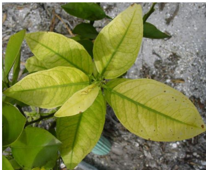
Figure 1. Iron deficiency symptoms

Iron deficiency is common on calcareous soils. A calcareous soil contains a high concentration of calcium carbonate and has a pH of about 8.3. These soils may contain appreciable amounts of Fe, but it exists in a form that is only slightly available to plants. Iron deficiency can also be attributed to