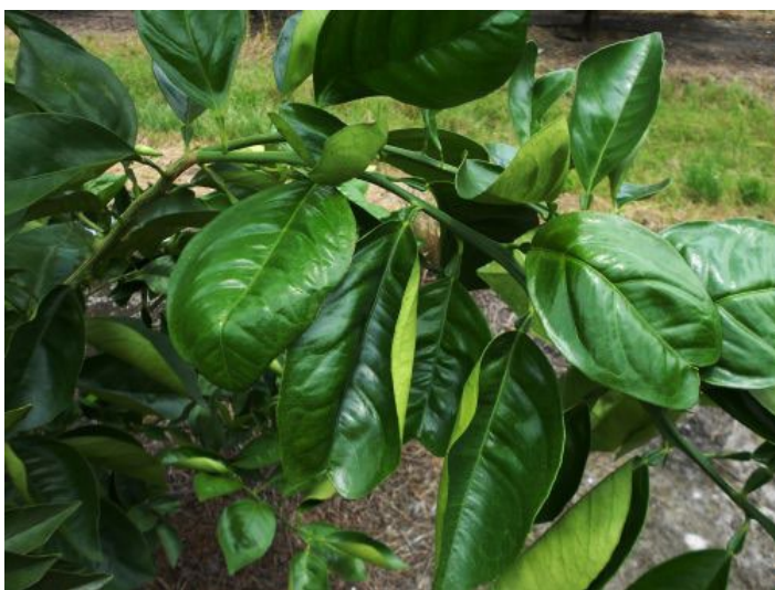
Figure 3. Copper deficiency symptoms

The first symptom of Cu deficiency is formation of unusually vigorous, large, and dark green foliage with a “bowing up” of the midrib. Twigs are also unusually vigorous, long, soft, angular, frequently S-shaped, and somewhat drooping (Figure 3). As the deficiency becomes acute and the twigs start to die, some of the weak twigs will bear very small, yellowish-green leaves that drop quickly, leaving the twig defoliated.