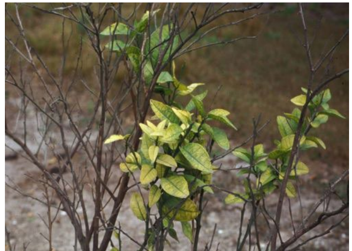
Figure 2. Iron deficiency symptoms

The symptom of Fe deficiency is known as “iron chlorosis” and is called “lime-induced chlorosis” when it occurs on calcareous soils. Deficiency symptoms occur on young leaves, which appear a light yellow to white in color, with the veins greener than the remainder of the leaf (Figure 1). In acute cases, the leaves are reduced in size, and they are fragile, very thin, and can shed early. The trees die back severely on the periphery and especially at the top (Figure 2). Some trees may have a dead top with the lower limbs carrying almost normal foliage. Eventually, tree canopy volume decreases and fruit set and yield are reduced. The fruits tend to be small with reduced soluble solids and acidity in the juice. Sometimes, only a tree branch may be affected, or perhaps only a few trees in a grove will be chlorotic. In severe cases, the entire tree is affected. The tree loses some of its leaves, becomes unproductive, and dieback, or copper deficiency, results.