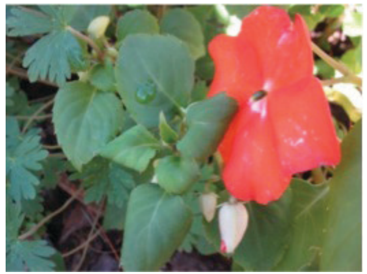
Figure 2. Faint gray lines may be seen on the tops of leaves, or leaf edges may curl downward.

As the disease continues to progress, whitish, downylooking growth is visible on the undersides of leaves (Fig 3). This whitish growth consists of spore-containing structures that have emerged from the lower leaf pores (stomata). Next, leaves and flowers will drop quickly, leaving mostly stems (Fig 4).