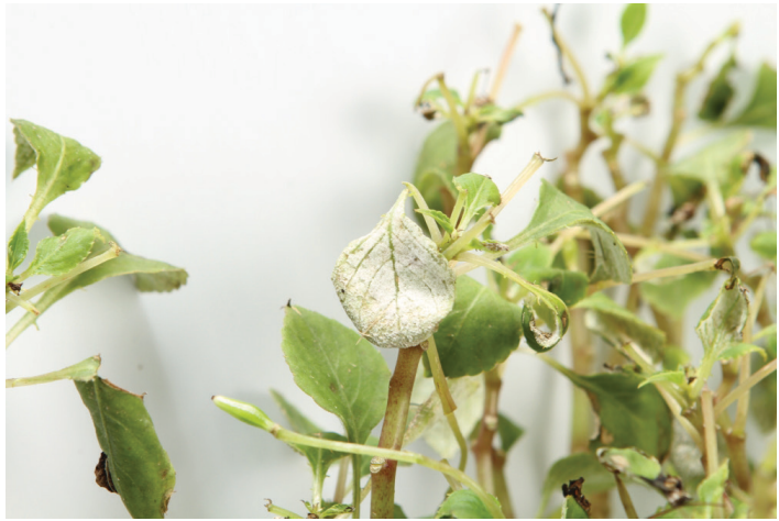
Figure 3. As the disease continues to progress, whitish, downy-looking growth is visible on the undersides of leaves.

As the disease continues to progress, whitish, downylooking growth is visible on the undersides of leaves (Fig 3). This whitish growth consists of spore-containing structures that have emerged from the lower leaf pores (stomata). Next, leaves and flowers will drop quickly, leaving mostly stems (Fig 4).