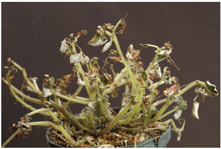
Figure 4. Eventually, leaves and flowers will drop, leaving mostly stems.

other type of spore, the oospore, forms inside plant tissues, where the pathogen can survive for years. Downy mildew is very aggressive and can rapidly spread, so action should be taken quickly if it is found.