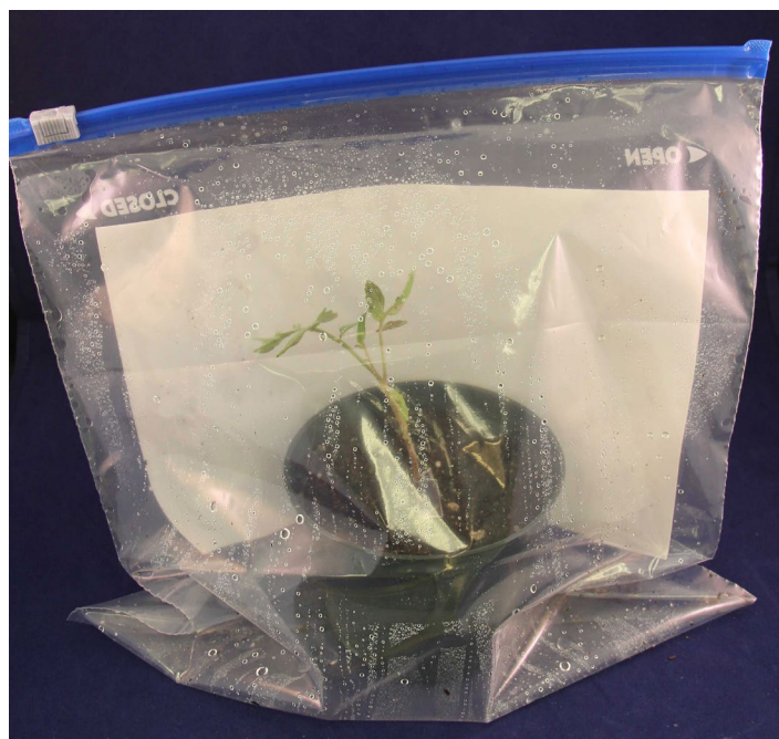
Figure 2. A grafted plant placed inside a resealable bag.

One day before the grafting is performed, mist water on the inside surfaces of an appropriate-sized plastic bag, using a hand sprayer, and close it. This practice ensures the RH will reach 95% before the grafted plants are placed inside the bags. After grafting, open the plastic bag, place the potted, grafted seedlings inside, and then immediately close the bag to avoid RH loss (Figure 2). If needed, mist more water inside the bag before placing the plants inside. In order to avoid humidity loss to the outside air, there must be enough space to tighten the bag. Resealable bags can be a convenient option, since they can be tightly closed.