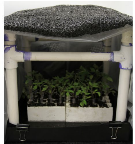
Figure 5. Healing chamber built with PVC pipes, plastic, and binder clips. From the left: open chamber, closed with plastic, and covered with shade cloth.