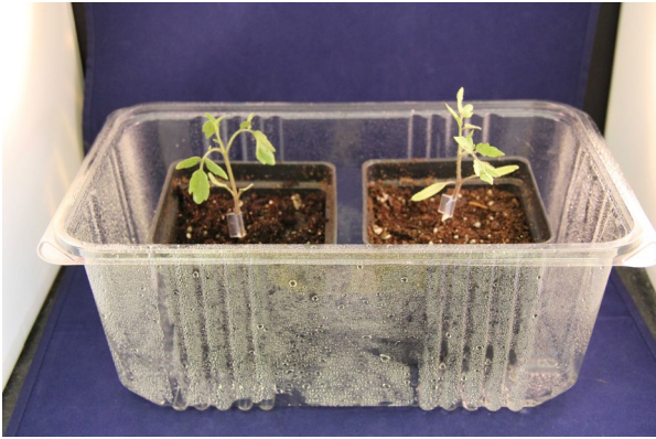
Figure 3. Grafted plants inside salad container.