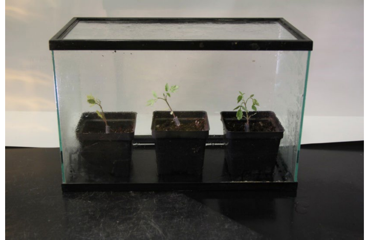
Figure 4. An upside-down aquarium used as a healing chamber.

graftings being produced at a time increases. Alternatively, a small chamber can be built using polyvinyl chloride (PVC) pipes as the frame, a plastic tray as the bottom, and a plastic cover to maintain high RH (Figure 5). To make the transplant tray's management and RH maintenance easier, the structure's height should not exceed three feet and its width and length should not exceed five feet (Johnson, Kreider, and Miles 2011a). One day before the grafting is performed, use a hand sprayer to mist water on the inside surfaces, pour water in the bottom, and close it to increase RH. The trays must be placed above the water level to avoid water saturation in the media.