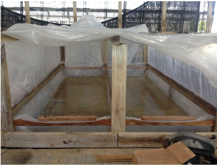
Figure 6. A wood-framed healing chamber, which would be found in a large-scale grafting operation.

For a large-scale grafting operation, healing chambers can be built inside a separate area of the greenhouse or over the transplant tray benches. Wood or PVC pipes can be used to build the chamber's frames, and plastic can cover the structure (Figure 6). A pool of water can be maintained below the structure to provide high RH, eliminating the need to spray the surfaces of the chambers. The trays must be placed above the water level to avoid water saturation in the media. One day before grafting is performed, fill the water pool in the bottom of the chamber, and then close it to increase RH.