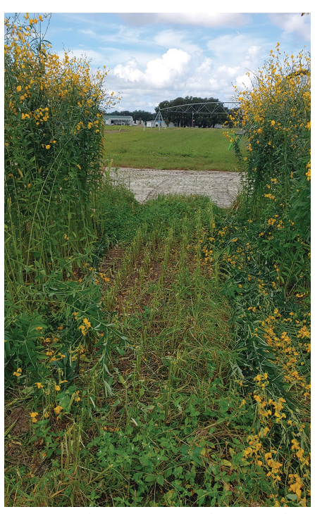
Figure 10. Organic amendments: Cut sunn hemp can be collected then applied as a mulch to crops in a different location.

that allowed nematodes to pass in and out were filled with sunn hemp hay and buried in soil. Periodic analysis of the bags showed that sunn hemp decomposition was fairly rapid, and most was completed within two weeks. Population densities of nematodes feeding on bacteria increased greatly during decomposition, and this was followed by an increase in omnivorous nematodes that fed on them. However, plant-parasitic nematodes were neither affected by the sunn hemp decomposition nor by the omnivorous nematodes. In fact, plant-parasitic nematode numbers increased over time with increasing crop biomass, which may indicate that sunn hemp residue does not have a direct detrimental effect on plant-parasitic nematodes. In another recent study, Chellemi (2006) used urban plant debris (green waste from public landfill deposited by homeowners and landscape companies) to amend pepper fields in southeast Florida. As a result, the combined density of plant-parasitic nematodes was reduced, and other diseasecausing plant pathogens (Pythium spp. and Phytophthora spp.) were reduced as well. These examples illustrate the potential use of organic amendments for direct or indirect management of nematodes, but they also indicate that outcomes can be complex and unpredictable.