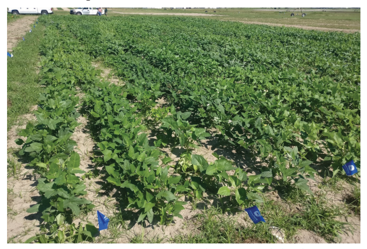
Figure 6. Cowpea growing in research plots in central Florida.

1995; McSorley et al. 1994). Even though these cover crops are effective against root-knot nematodes, they might increase other harmful plant-parasitic nematodes that are also present in the soil. For example, densities of the sting nematode (Belonolaimus longicaudatus) and stubby-root nematode (Paratrichodorus minor) increased on 'SX-17' sorghum-sudangrass. 'Mississippi Silver' cowpea was able to reduce P. minor and M. incognita but increased B. longicaudatus. The most effective cover crop that simultaneously reduced root-knot, stubby-root, and sting nematodes was determined to be velvetbean (McSorley and Dickson 1995). Results vary in different locations as well. In Kenya, a plant related to sunn hemp (C. ochroleuca) that successfully reduced populations of root-knot nematodes appeared to increase the occurrence of lesion nematodes (Pratylenchus zeae), whereas jack bean (Canavalia ensiformis), hyacinth bean (Lablab purpureus), and velvet bean appeared to reduce both species of nematodes (Arim et al. 2006).