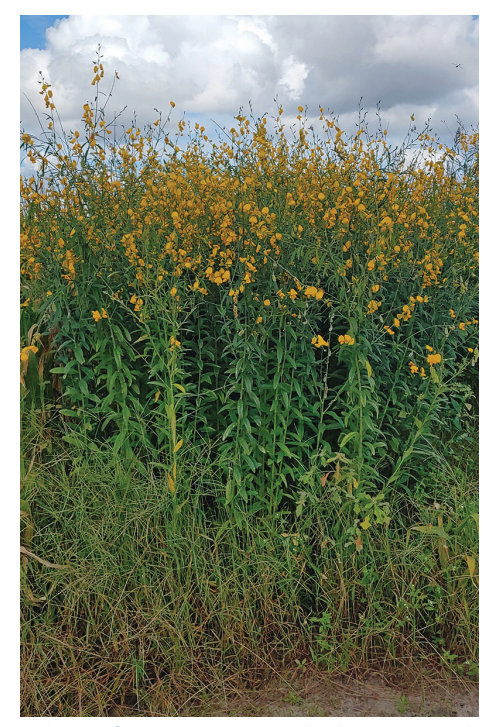
Figure 8. Sunn hemp flowering in research plots in central Florida.