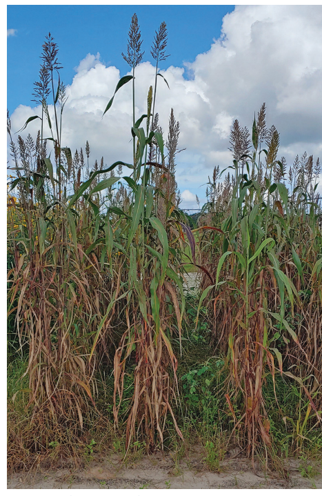
Figure 7. Mature sorghum x sudangrass growing in research plots in central Florida.

to the publication of the Sustainable Agriculture Research and Education program on cover crops (Magdoff and van Es 2021). For more information on cover crops for managing nematodes, see the following Ask IFAS publications on cover crops and root-knot nematodes (Gill and McSorley 2017), cowpea (Wang et al. 2021), sorghum and its relatives (Dover et al. 2021), and sunn hemp (Wang et al. 2022).