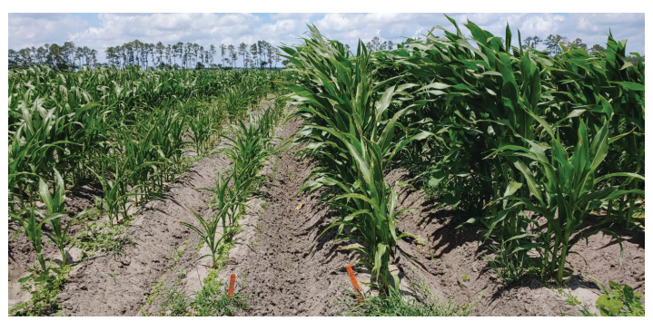
Figure 3. Stunting is a common symptom of plant-parasitic nematode infestation. The corn plants on the left are severely stunted by sting nematode, while the healthy corn plants on the right were protected from sting nematode by pesticide application.

Since most plant-parasitic nematodes feed on plant roots, symptoms are comparable to nutrient or water deficiency. These can be yield loss, stunting (Figure 3), yellowing, wilting, symptoms of nutrient deficiency, and malformations of the root system caused by direct feeding damage. In addition, invasion by plant-parasitic nematodes often provides an infection route for other organisms such as bacteria or fungi since nematode activity creates an entryway into the root that would otherwise not be available. Nematode reproduction is very fast. On average, a typical life cycle may be only 30 days at summer temperatures. This means that even if nematode numbers are low at the beginning of the growing season, nematode populations can rapidly increase and can become harmful to the crop in a relatively short period of time.