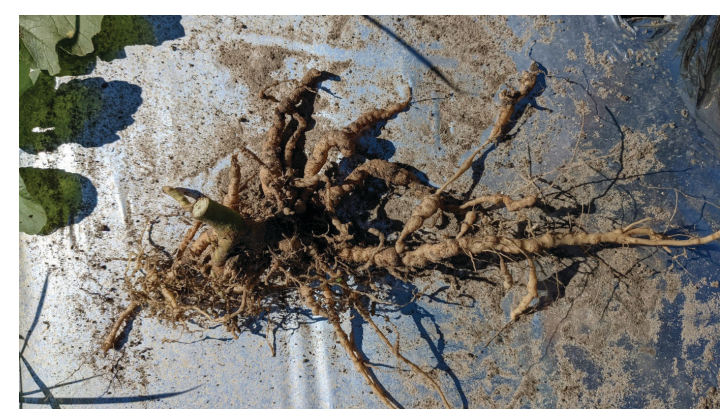
Figure 4. Galls—abnormal swellings—on tomato roots caused by root-knot nematodes.

Often, the most damaging nematodes in the southeastern United States and the tropics are root-knot nematodes (Meloidogyne spp.). These nematodes are pests of nearly all major crops and are therefore widespread. Damage can be directly observed by examining the roots because root-knot nematodes produce galls or knot-like swellings along the plant roots of most crop species (Figure 4). These galls cannot not be easily removed because they are part of the plant root tissue. In contrast, nodules caused by beneficial nitrogen-fixing bacteria—such as those often found on roots of leguminous crops like peanuts and beans—can be easily removed and have a more uniform shape (Figure 5). Another method to distinguish nematode galls from nodules is to slice them in half and expose them to air, which will cause nitrogen-fixing nodules to appear pink or red if the bacterial colony is active, or green or brown if the colony is inactive.