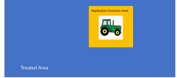
Figure 6. The blue area represents the entire treated area. The gold zone indicates the application exclusion zone.

AEZ is dependent upon the application method and the spray quality. This includes nozzle design, system pressure, and the speed of the equipment. Handlers must be made aware of any restrictions, including the AEZ and REIs. Pesticide handlers are also responsible for suspending applications if any person enters or is in the AEZ. The agricultural employer must not allow a pesticide to be applied or an application to be resumed while a worker or other person on the establishment is in the AEZ. More details for measuring the AEZ and suspending application can be found in the HTC (pp. 37–38, 60–61).