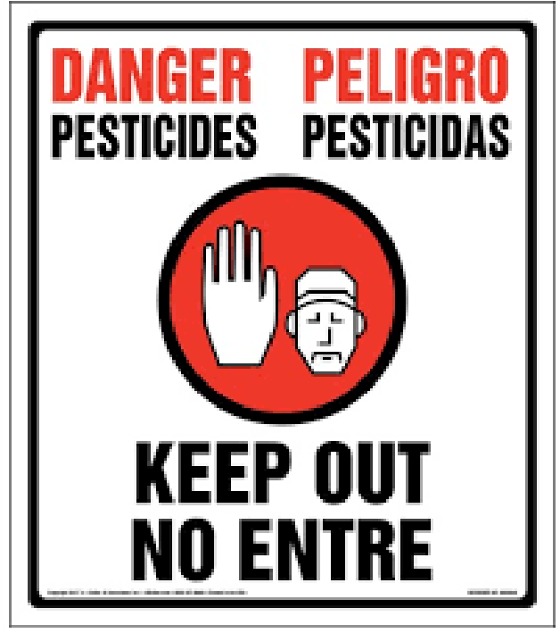
Figure 3. Example of a warning sign to be used prior to application and until the REI is reached.

not permitted while signs are posted even if the REI has expired. Warning signs should be posted prior to but no longer than 24 hours before the scheduled application of the pesticide. Warning signs are to remain posted throughout the application and the REI. Remove or cover signs within 3 days after the end of the REI. Details of sign content, posting location, and sign size are detailed in the HTC (pp. 45–47).