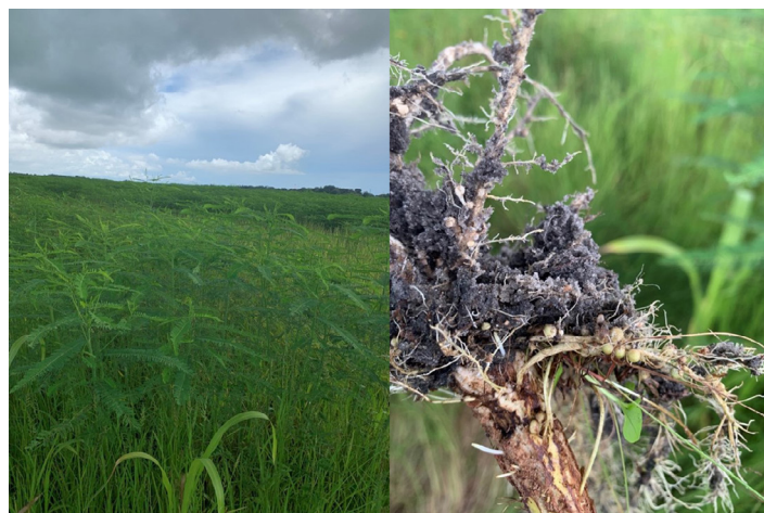
Figure 3. Sunn hemp is grown in South Florida.

Table 1 for N credit). As mentioned earlier, the total amount of N supplied by a legume depends upon its biomass productivity and nitrogen content. Legume cover crops have the potential for the highest BNF and can fix substantial amounts of plant-available N for the next crop. Legume cover crops could yield between 70 to 100 lb. N per acre when grown to the bud stage to gain sufficient size (biomass). The total N fixation potential for different legumes grown in Florida is presented in Table 1.