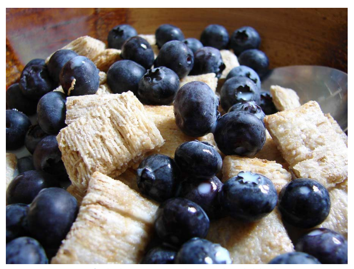
Figure 4. Image of whole grain cereal topped with blueberries.