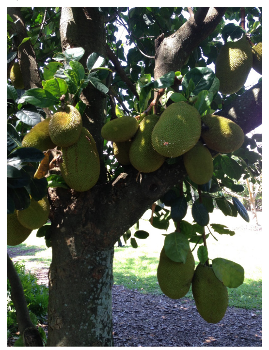
Figure 3. This jackfruit tree is the right plant for the right place and has been adequately absorbing the nutrients that have been provided in the soil.

N-P-K ratio. The fertilizer market has many options, some of which may not be suitable for Florida. It is important to note that every herb, vegetable, shrub, and fruit tree has unique needs, and fertilizer labels should be examined carefully to ensure that the fertilizer meets your plant's needs. Soil test results from UF/IFAS Extension Soil Testing Laboratory include fertilizer recommendations. In many parts of Florida, phosphorus is abundant in the soil. If that is the case in your general area, only use fertilizer containing phosphorous if your soil test comes back with a deficiency (a state law).