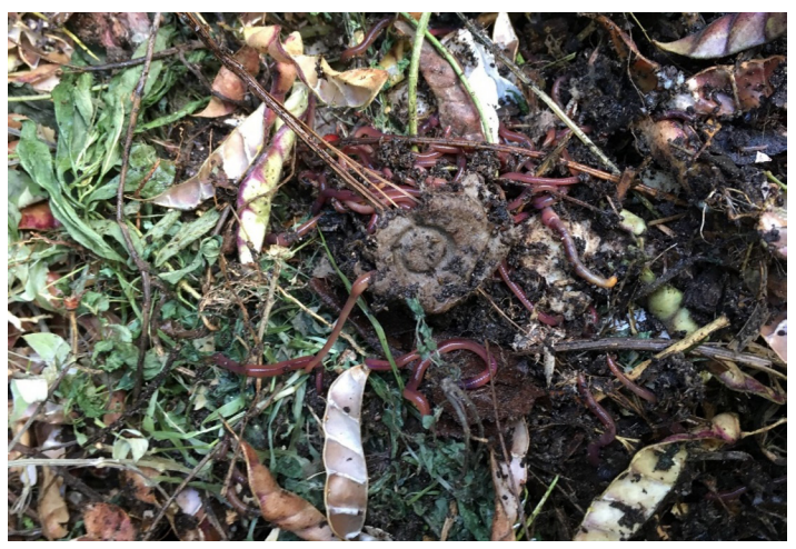
Figure 6. Healthy compost incorporates "greens" (kitchen scraps), "browns" (paper products), and live organisms like microbes or worms.

Adding compost, manure, and mulch to your soil will increase the amount of organic matter and improve the health and production of edibles and landscape plants. Compost, often called "garden gold," benefits Florida's infertile native soils. Organic mulch contributes to soil health as a result of the decomposition process.