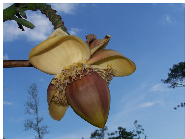
Figure 1. Bananas are heavy feeders and need enhancements to thrive in our sandy soils. Use compost, composted manure, or other amendments to encourage flowering and fruiting.

on soil. A glossary of frequently used terms is listed at the bottom of this article. More detailed information suitable for these practices can be found in Edible Landscaping Using the Nine Florida-Friendly Landscaping™ Principles at https://edis.ifas.ufl.edu/publication/EP594.