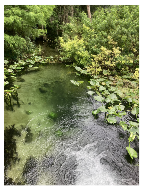
Figure 4. Waterways, like the Little Wekiva River in Seminole County, have been negatively impacted by pollution from nitrogen and phosphorous runoff arising from inappropriate fertilization. Credits: Tina McIntyre, UF/IFAS

If you are fertilizing, be mindful of local fertilizer ordinances by referring to the Florida-Friendly Landscaping™ Fertilizer App: https://ffl.ifas.ufl.edu/fertilizer/ (Figure 5). Fertilizer runoff is a major contributor to algal blooms in Florida and can damage local ecosystems. To learn more, visit Quantifying Impacts of Fertilizer Workshops on Nitrogen Leaching and Subsequent Economic Impacts: A Case Study at https://edis.ifas.ufl.edu/publication/SS705.