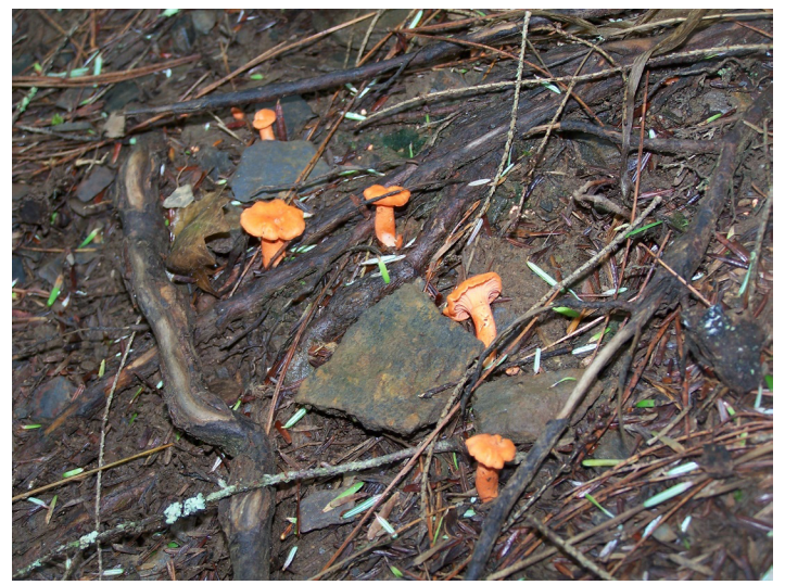
Figure 8. Fruiting bodies of fungus in robust and fertile topsoil.