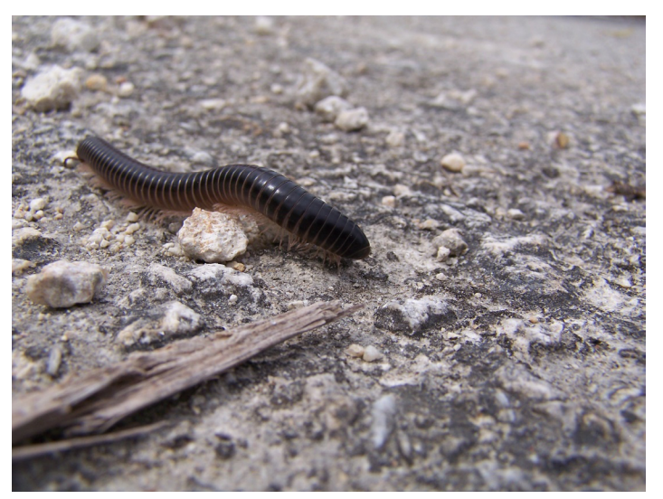
Figure 9. Millipedes are part of the soil food web and are beneficial to soil.