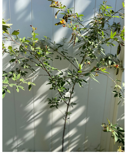
Figure 7. Pigeon pea growing in the home landscape.

If you are growing annual vegetables, you have a good opportunity to increase soil organic matter by utilizing cover crops, crop rotation, and intercropping. Some edibles and plants can increase soil fertility and are grown specifically for this purpose. For example, legumes can produce 90% of their own nitrogen (USDA-NRCS 1998). When tilled into the soil and allowed to decompose after harvest, approximately two-thirds of that nitrogen is available for the next crop rotation. Some legumes, like pigeon peas (Figure 7), have large taproots that can access nutrients deep within the soil and can break up compacted soil. When composted, nutrients are reintroduced into the soil system for other fruits and vegetables to use. Legumes also improve the soil's microbial activity and physical and chemical properties (USDA-NRCS 1998). Cover crops, such as cowpea, winter rye, and sunn hemp may also aid in soil recovery, reduce erosion, and aid in pest and weed management. Some are referred to as "green manure," a crop primarily used for soil amendment and as a nutrient source; examples include cowpea, clover, oats, and buckwheat. Crop rotation is beneficial to soil rejuvenation. By leaving a field fallow for a season or planting another species that will primarily require and use different nutrients, the soil microbiome can recover nutrients from the last growing season.