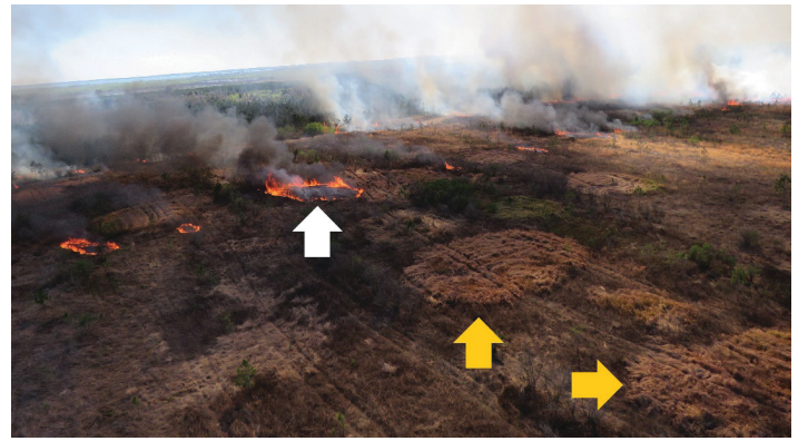
Figure 3. Aerially ignited prescribed fire in a cogongrass-infested field showing increased fire spread rate where the spheres (ignition source) landed in cogongrass (white arrow, with yellow arrows pointing to other cogongrass patches).

during the season immediately post-fire than during the post-monsoon season (Pathak et al. 2018).