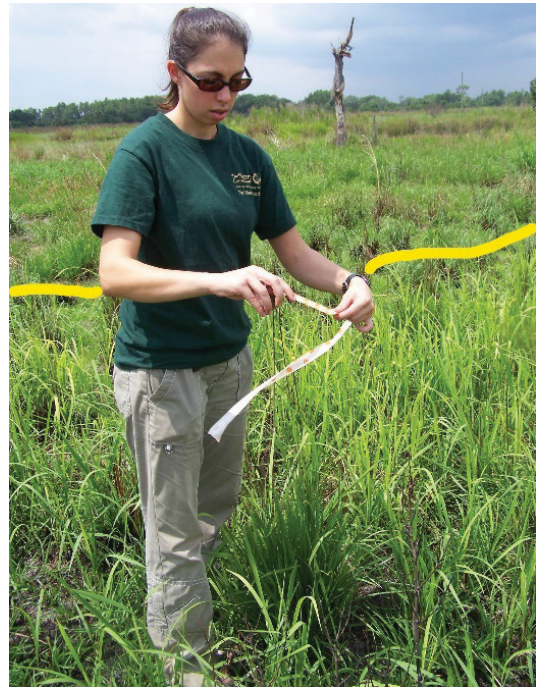
Figure 2. A field technician ties flagging tape to mark a patch of newly discovered cogongrass (edge marked in yellow) during a post-fire invasive plant survey in a recently burned grassland.

and spike-like, with densely packed, white, fluffy seeds (MacDonald 2004).