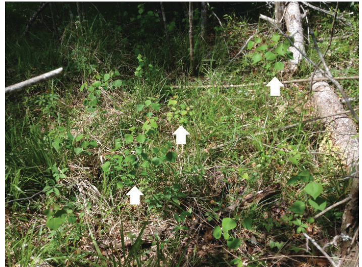
Figure 4. Chinese tallow seedlings (some with white arrows) grow scattered among grasses in a clearing created from treating mature trees, which are now fallen logs.

Studies on the effects of fire on germination of Chinese tallow have yielded varied results. One study found higher germination rates in a regularly burned area, and the authors proposed that this is likely due to the removal of litter (indirect effect) and encouragement of germination (direct effect) of T. sebifera seeds (Samuels 2004, Figure 4). However, another study reported decreased germination immediately after a fire (7.4% in unburned plots versus 1% in burned plots) (Burns and Miller 2004). A study in North Carolina found no survival in Chinese tallow seedlings at 2 years in burned plots, whereas unburned plots averaged 43% survival at 2 years and 8% at 42 months (Just, Hohmann, and Hoffmann 2017).