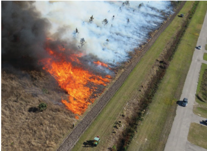
Figure 1. Aerial view of a person igniting a prescribed fire along a fire line in a non-native grass-dominated system in Florida.

microphyllum ), and Japanese climbing fern ( L. japonicum ). These four plant species are widespread in Florida and have large numbers of reports in the Early Detection and Distribution Mapping System (EDDMapS 2021).