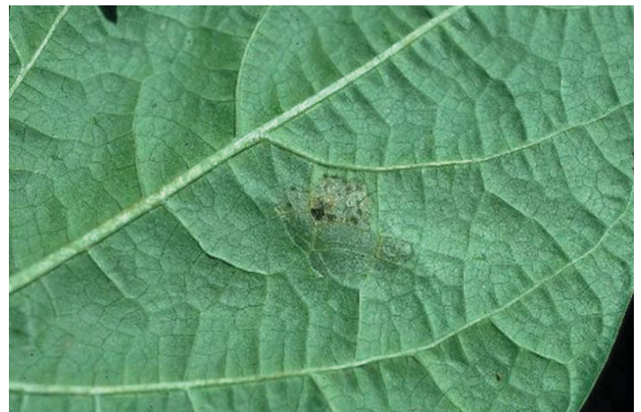
Figure 1. Initial symptoms associated with common bacterial blight on underside of bean leaves consist of water-soaked lesions.

conditions, pod lesions become covered with a yellowish bacterial ooze that can dry to a yellowish, crusty mass. Interestingly, in south Florida, significant pod symptoms can appear with little foliar damage.