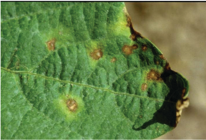
Figure 2. More advanced lesion of common bacterial blight on top surface of bean leaf showing beginning of chlorotic (yellow) halo around lesion.