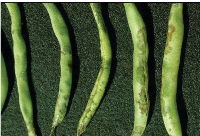
Figure 4. Striking water-soaking symptoms of common bacterial blight on bean pods.

Contaminated seed is probably the major source of bacteria introduced into new fields of bean crops. Water-soaked lesions in young bean plants may be caused by cells of X. c. pv. phaseoli from seed as these cells invade emerging seedlings. The bacterial cells may colonize the surface of