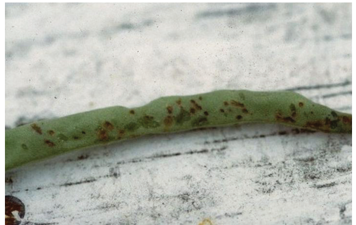
Figure 5. Advanced symptoms on bean pods, with appearance of characteristic brick-red areas in center of lesions.

shoot tissues, inciting more disease later, when favorable conditions are present.