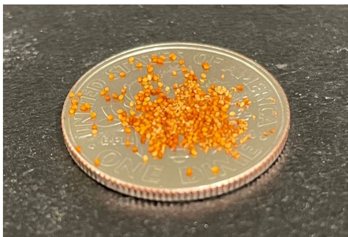
Figure 10. Begonia seeds on a US dime.

Begonia is highly heterozygous, unlike some annual inbred ornamentals with perfect flowers. Most begonia plants have a mixed genetic background, and progenies from their seeds will not be true-to-type to the parental plants, even after self-pollination. Progeny seedlings will vary greatly and tend to differ from the parents. Another challenge for sexual propagation is that begonia seeds are tiny, ranging from 15–20 milligrams per 1000 seeds (Figure 10). In other words, there may be around 88,000 seeds per gram for wax begonia ( Begonia Semperflorens-cultorum ) and about 35,000 seeds per gram for tuber begonia ( B. × tuber hybrid ). In addition, begonia seeds cannot be stored well unless proper measures are taken (Haba 2015). Attention should also be given to the seed quality for different varieties. Seeds for some varieties may remain dormant for extended periods, while other seeds may have low viability due to developmental defects.