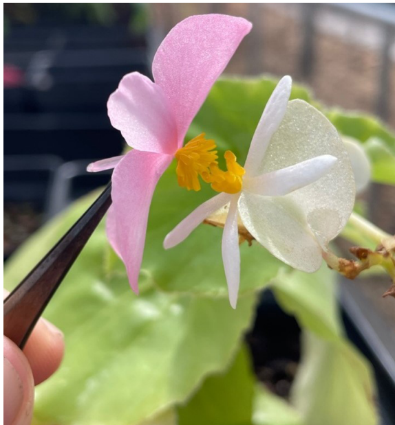
Figure 6. Male and female floral contact. Notice the light contact of the anthers on the male flower (left) with the stigmas on the female flower (right). You should be able to observe pollen grains on the stigma after the brushing is complete.