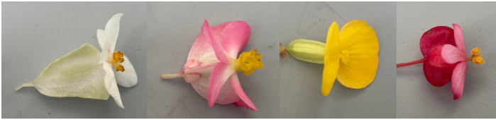
Figure 3. Female flowers found throughout the genus Begonia . Note the three-winged ovary in all four specimens. From left to right are female flowers of B. dregei 'Glasgow', unnamed begonia hybrid, B. microsperma , and B. coriacea .