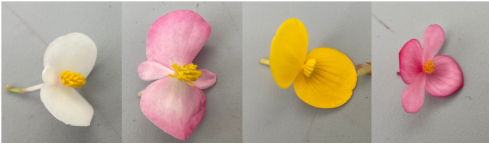
Figure 2. Male flowers found throughout the genus Begonia . From left to right are male flowers of B. dregei 'Glasgow', unnamed begonia hybrid, B. microsperma , and B. coriacea .