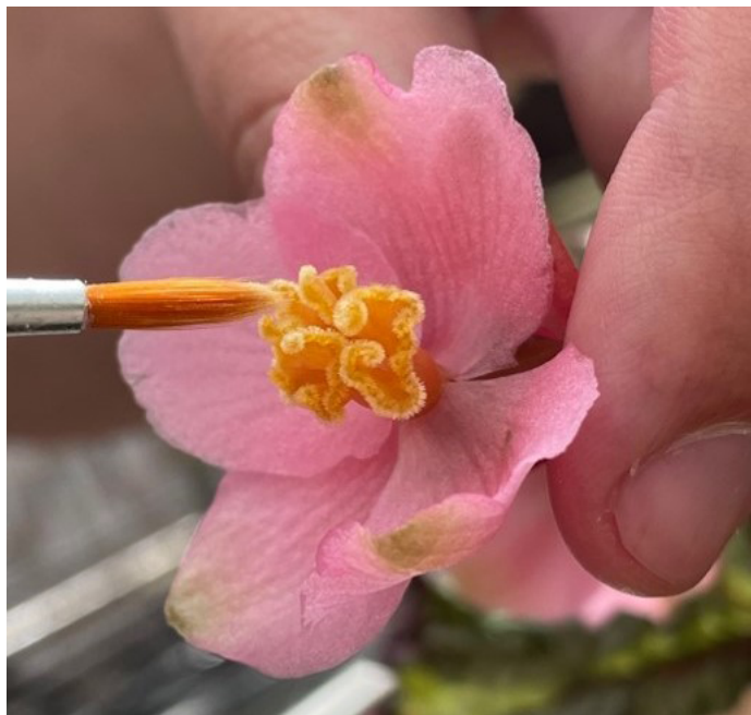
Figure 8. Brushing the stigma with a pollen-covered brush. Notice the pollen on the bristles and the stigmas.