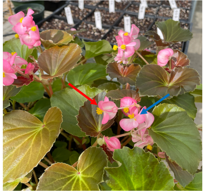
Figure 4. Both male (blue arrow) and female (red arrow) on the same plant.

how to successfully pollinate begonia flowers using both methods.