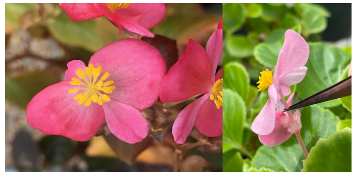
Figure 5. Male begonia flowers. Left, male flower with pollen grains on tepals that are ready to pollinate. Right, forceps gripping the petiole of the male flower.