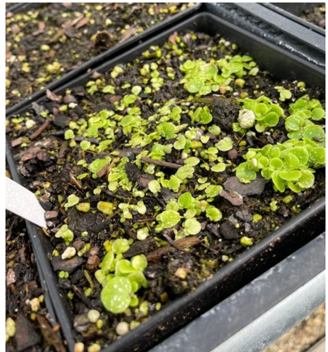
Figure 1. Begonia seeds that have germinated.

production requires self-pollination; most begonias are self-compatible, which means pollen from male flowers on one plant can successfully pollinate and fertilize female flowers on the same plant. In order to ensure self-pollination occurs, manual crossings are generally required for pollination.