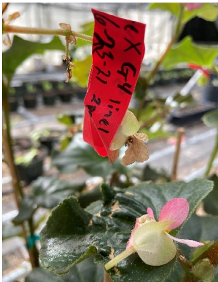
Figure 7. Image depicting how to attach a cross information tag. In this case, simple painter's tape works well. Notice that the tape slightly covers the ovary of the female flower. This is so if the flower detaches from the plant, the tag will fall with it.