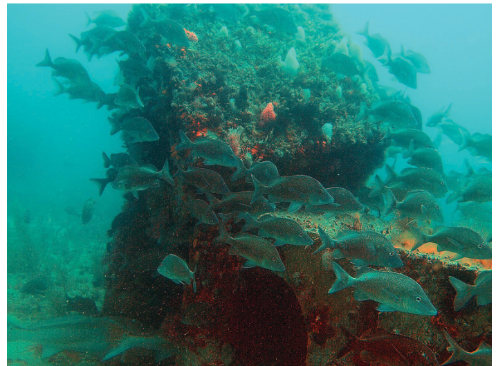
Figure 2. Many species of fish will find artificial reefs attractive for foraging, refuge, or both. This photo shows fish around an artificial reef in Taylor County.

However, these hypothetical examples are unrealistic in that they do not consider any predators of the fish. Predators (in this hypothetical example, sharks) might also be attracted and could themselves use the reef to forage (Hixon and Beets 1989; Lindberg et al. 2006). This could diminish some of the population gains from the greater shelter and forage. In extreme cases, it could even lead to an ecological trap. An ecological trap is a scenario when some environmental cue leads organisms to settle on poor-quality habitats. In our example with white grunt, an ecological trap could occur if artificial reefs attract not only white grunt but their predators like sharks or larger fish, and if for whatever reasons the white grunt are easier for their predators to catch around artificial reefs. In this ecological trap, the white grunt might keep getting attracted to the reef but would then suffer greater mortality there. However, we do not think this is likely to occur very often, at least with most natural predators. But it is worth considering that a similar thing could occur if the predator was a recreational fisher. This effect will be described in part three of the series (FA243). In all, it is reasonably safe to assume artificial reefs result in some additional benefit to fish populations, at least if one does not consider how artificial reefs may affect fishing harvest rates.