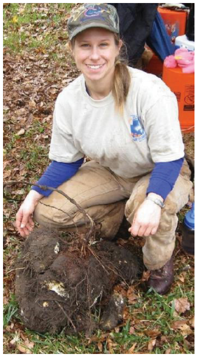
Figure 6. Underground tuber of winged yam.

Three other introduced species of Dioscorea may be encountered in Florida: Chinese yam ( D. polystachya , high invasion risk), Zanzibar yam ( D. sansibarensis , high invasion risk), and ornamental yam ( D. dodecaneura , unknown invasion risk). Our native wild yams ( D. villosa and D. floridana ) are infrequent in hammocks and floodplains of northern and western Florida; these never form aerial tubers and have leaf blades that rarely reach 6 in long.