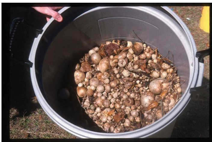
Figure 7. Remove air potato bulbils and other plant material from the site and dispose of in such a way that they do not spread the vines to new areas.

The air potato leaf beetle feeds on the leaves and causes a skeleton-like appearance (Figure 8). The damage can be so severe that aerial bulbil production, climbing ability, and competitive nature of air potato are all greatly reduced. The insect does not eradicate air potato, but the damage it inflicts makes this insect a growing success story for biological control in Florida. For more information on the biology and ecology of the air potato leaf beetle, see EDIS publication EENY-547, Air Potato Leaf Beetle (Suggested Common Name), Lilioceris cheni Gressitt and Kimoto (Insecta: Coleoptera: Chrysomelidae: Criocerinae) (https://edis. ifas.ufl.edu/in972). The insect has been widely distributed throughout Florida at thousands of release sites. Currently, availability of the insect for continued distribution is handled by FDACS (https://www.fdacs.gov/Agriculture-Industry/Pests-and-Diseases/Plant-Pests-and-Diseases/ Biological-Control/Air-Potato-Vine-Biological-Control) because the UF/IFAS redistribution program ended in 2019.