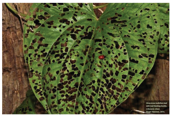
Figure 8. Dioscorea bulbifera leaf damage by the air potato leaf beetle, Lilioceris cheni .

For areas where the air potato leaf beetle has not successfully established, the herbicide glyphosate can be used for air potato control. Glyphosate is effective for foliar applications but does not kill aerial bulbils that have already been produced. The high climbing growth also makes foliar treatment difficult for applicators, and only partial control is achieved. Additionally, glyphosate is not effective in completely killing the underground tubers, which resprout following foliar treatment. This generally results in the need for multiple treatments. The optimal treatment timing is in the late summer and fall when downward translocation of the herbicide to the roots and tubers is maximized. However, air potato is susceptible to frost, and poor control is likely if plants experience a cold period just before or shortly after treatment.