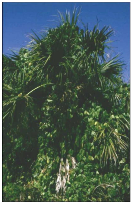
Figure 1. Air potato vine engulfing native cabbage palm.