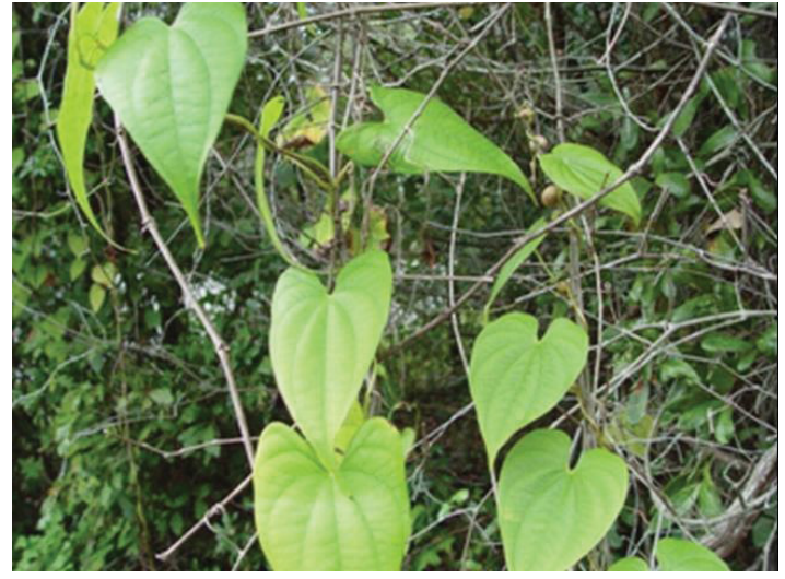
Figure 5. Side-by-side comparison of winged yam (left) and air potato (right).

Three other introduced species of Dioscorea may be encountered in Florida: Chinese yam ( D. polystachya , high invasion risk), Zanzibar yam ( D. sansibarensis , high invasion risk), and ornamental yam ( D. dodecaneura , unknown invasion risk). Our native wild yams ( D. villosa and D. floridana ) are infrequent in hammocks and floodplains of northern and western Florida; these never form aerial tubers and have leaf blades that rarely reach 6 in long.