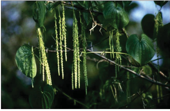
Figure 4. Air potato flowers.

shows air potato and winged yam growing alongside each other. Although not as abundant as air potato, winged yam nonetheless ranges from Escambia to Miami-Dade Counties ( Dioscorea alata - Species Page - ISB: Atlas of Florida Plants (usf.edu)) and is likely now more prevalent than previously thought. Winged yam can produce massive edible tubers (Figure 6), some of which have been recorded to weigh over 100 pounds.