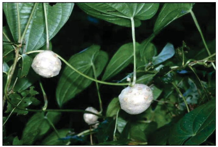
Figure 2. Air potato bulbils form in leaf axils.

from one point (Figures 3 and 4). Flowers are rare (in Florida), small, and fragrant, with male and female flowers arising from leaf axils on separate plants (i.e., a dioecious species) in panicles or spikes up to 4 in long (Figure 4). To date, only female plants have been found in Florida. Fruit is a capsule; seeds are partially winged.